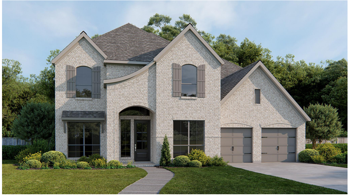
DESIGN 3593W E-1