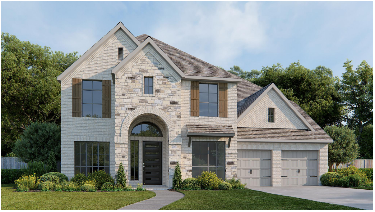
DESIGN 3593W E-70

*See Page 3 for Details and Disclaimers | © Perry Homes, LLC 2024 | 3/28/2024 9:29:17 AM (60' CL) PerryHomes.com