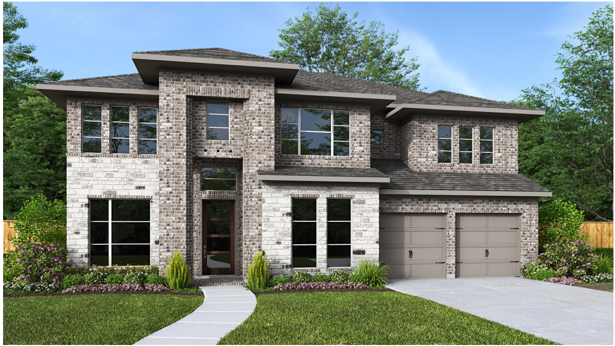
DESIGN 3593W E-50