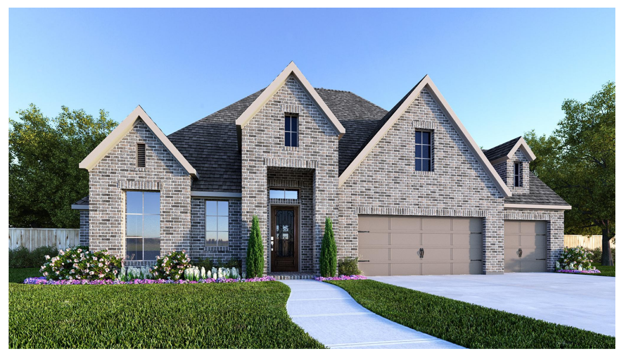
DESIGN 3634W E-1