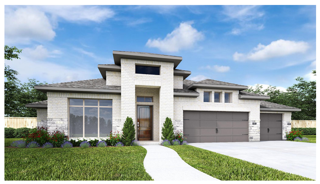
DESIGN 3634W E-30