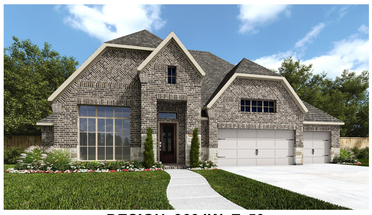
DESIGN 3634W E-50

This design, as originally designed and prior to any changes you make, is estimated to yield approximately the number of square feet shown on page 1. All dimensions are approximate. Square footage may vary based on as-built dimensions, configurations, plan options and/or the method of calculation. Designs are not-to-scale, and are conceptual illustrations that may differ from construction plans or completed improvements. A design may depict features not available on all homesites or in all communities. Perry Homes reserves the right to make changes in plans and specifications, and to substitute material of similar quality. Prices, terms, promotions, plans, dimensions, features, options, amenities, elevations, designs, square footages, specifications, materials, and availability of homes or communities to change without notice or obligation. All obligations will be governed by a written contract. This design does not constitute a commitment to build a particular floor plan or home in any given community. Some floor plans, options, and/or elevations may not be available on certain homesites or in a particular community and may require additional charges. Please check with Perry Homes to verify current offerings in the communities and are considering. This rendering is the property of Perry Homes. LLC. Any reproduction or exhibition is strictly prohibited @ Perry Homes LLC. 2012