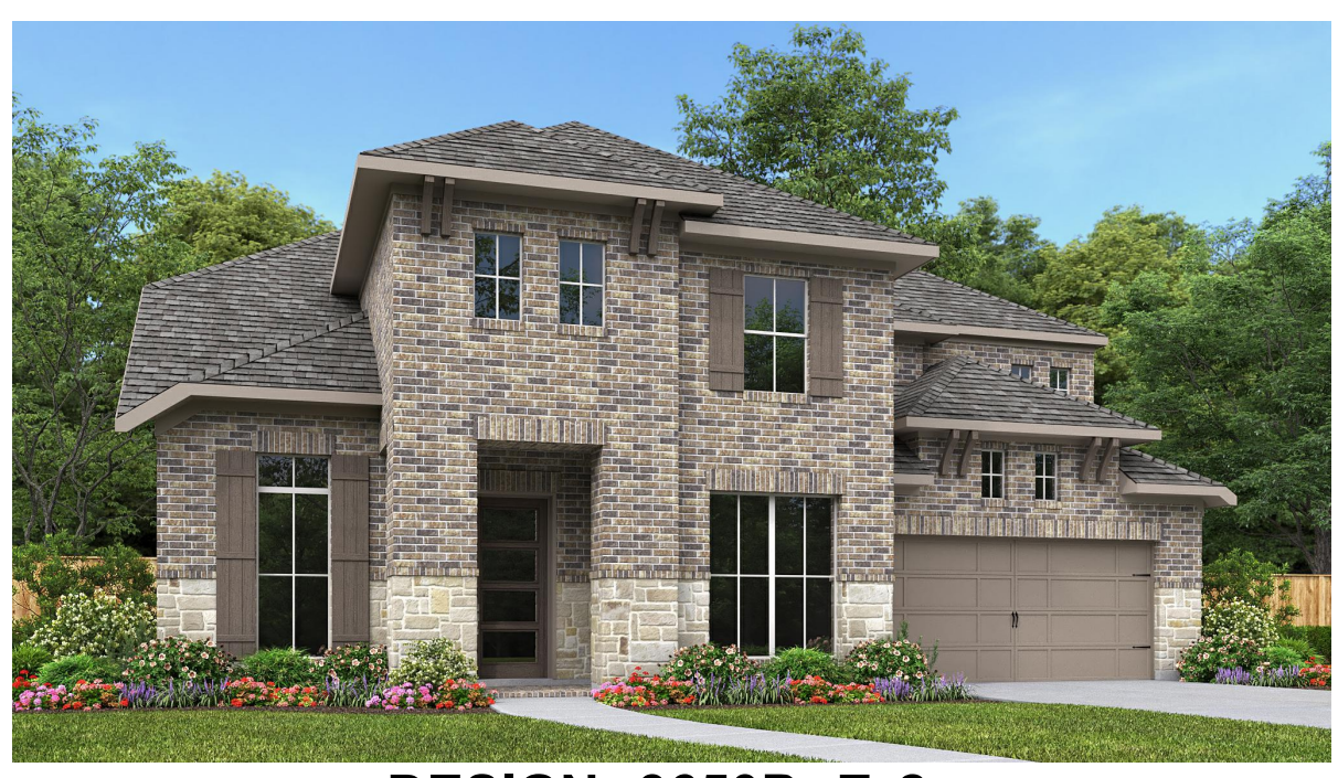
DESIGN 3650P E-2

This design, as originally designed and prior to any changes you make, is estimated to yield approximately the number of square feet shown on page 1. All dimensions are approximate. Square footage may vary based on as-built dimensions, configurations, plan options and/or the method of calculation. Designs are not-to-scale, and are conceptual illustrations that may differ from construction plans or completed improvements. A design may depict features not available on all homesites or in all communities. Perry Homes reserves the right to make changes in plans and specifications, and to substitute material of similar quality. Prices, terms, promotions, plans, dimensions, features, options, amenities, elevations, designs, square footages, specifications, materials, and availability of homes or communities change without notice or obligation. All obligations will be governed by a written contract. This design does not constitute a commitment to build a particular floor plan or home in any given community. Some floor plans, options, and/or elevations may not be available on certain homesites or in a particular community and may require additional charges. Please check with Perry Homes to verify current offerings in the communities you are considering. This rendering is the property of Perry Homes. LLC. Any reproduction or exhibition is strictly prohibited. © Perry Homes. LLC 2023