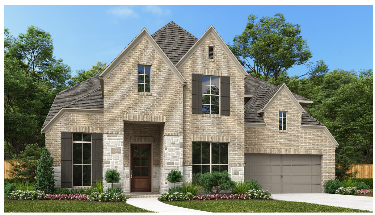
DESIGN 3650P E-1