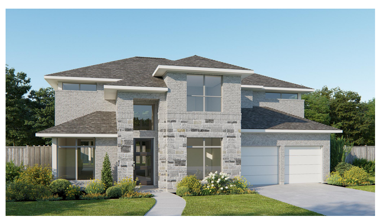
DESIGN 3650W E-30