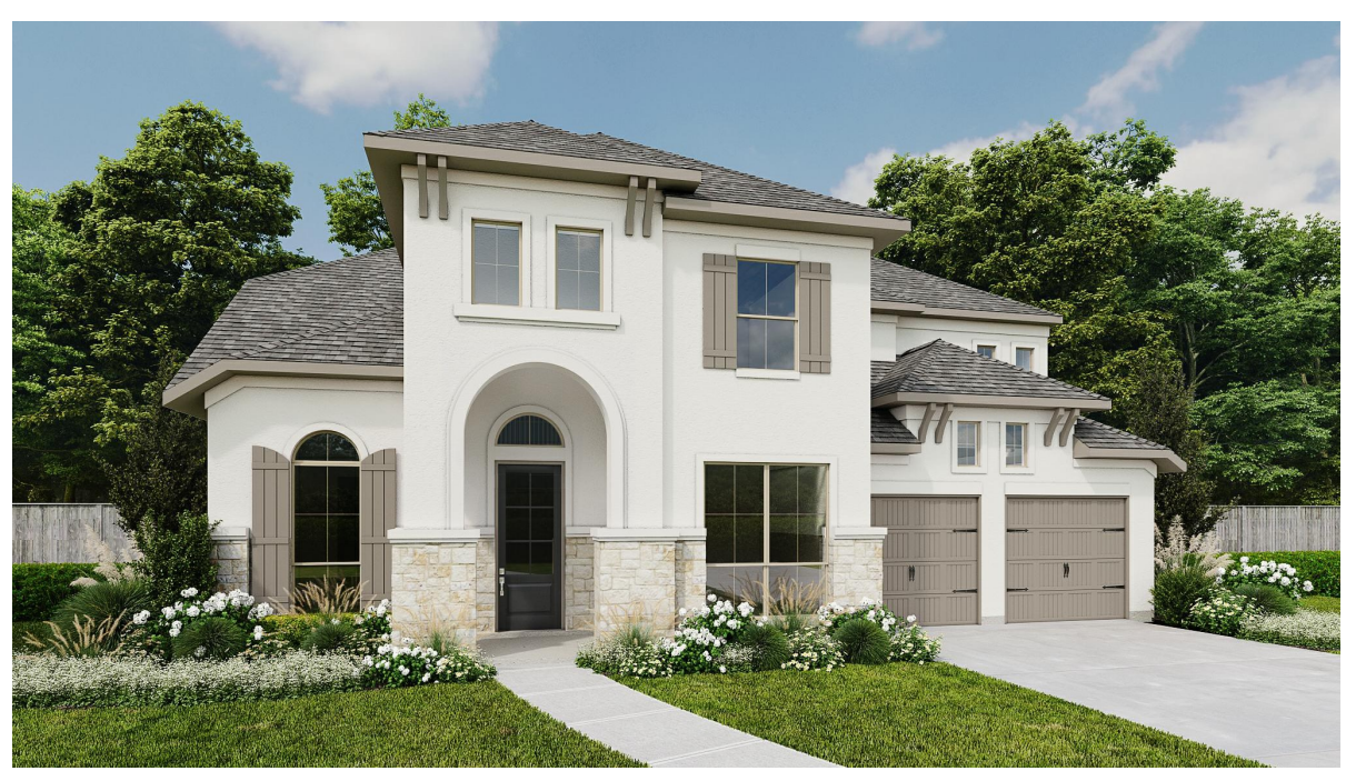
DESIGN 3650W E-70 Includes Stucco Front

This design, as originally designed and prior to any changes you make, is estimated to yield approximately the number of square feet shown on page 1. All dimensions are approximate. Square footage may vary based on as-built dimensions, configurations, plan options and/or the method of calculation. Designs are not-to-scale, and are conceptual illustrations that may differ from construction plans or completed improvements. A design may depict features not available on all homesites or in all communities. Perry Homes reserves the right to make changes in plans and specifications, and to substitute material of similar quality. Prices, terms, promotions, plans, dimensions, features, options, amenities, elevations, designs, square footages, specifications, materials, and availability of homes or communities are subject to change without notice or obligation. All obligations will be governed by a written contract. This design does not constitute a commitment to build a particular floor plan or home in any given community. Some floor plans, options, and/or elevations may not be available on certain homesites or in a particular community and may require additional charges. Please check with Perry Homes to verify current offerings in the communities you are considering. This rendering is the property of Perry Homes, LLC. Any reproduction or exhibition is strictly prohibited. Perry Homes, LLC 2023