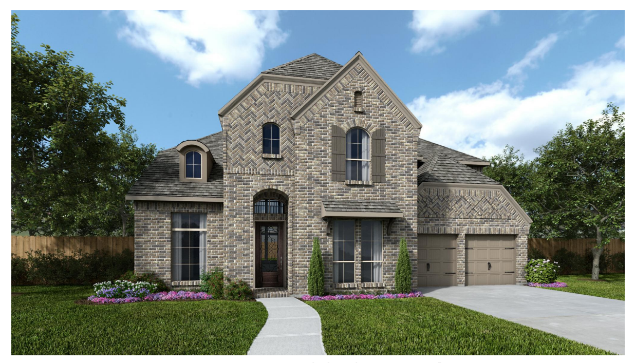
DESIGN 3650W E-1