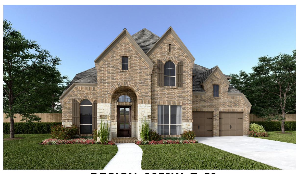
DESIGN 3650W E-50