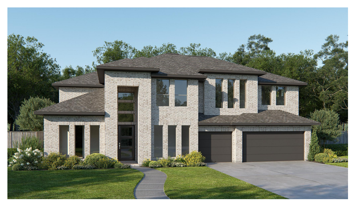
DESIGN 3658W E-1