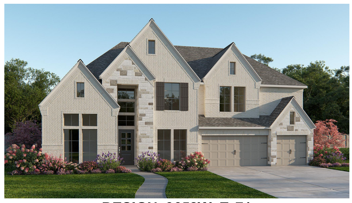
DESIGN 3658W E-71

This design, as originally designed and prior to any changes you make, is estimated to yield approximately the number of square feet shown on page 1. All dimensions are approximate. Square footage may vary based on as-built dimensions, configurations, plan options and/or the method of calculation. Designs are not-to-scale, and are conceptual illustrations that may differ from construction plans or completed improvements. A design may depict features not available on all homesites or in all communities. Perry Homes reserves the right to make changes in plans and specifications, and to substitute material of similar quality. Prices, terms, promotions, plans, dimensions, features, options, amenities, elevations, designs, square footages, specifications, materials, and availability of homes or communities evaluate to change without notice or obligation. All obligations will be governed by a written contract. This design does not constitute a commitment to build a particular floor plan or home in any given community. Some floor plans, options, and/or elevations may not be available on certain homesites or in a particular community and may require additional charges. Please check with Perry Homes to verify current offerings in the communities you are considering. This rendering is the property of Perry Homes. LLC. Any reproduction or exhibition is strictly prohibited. © Perry Homes. LLC 2023