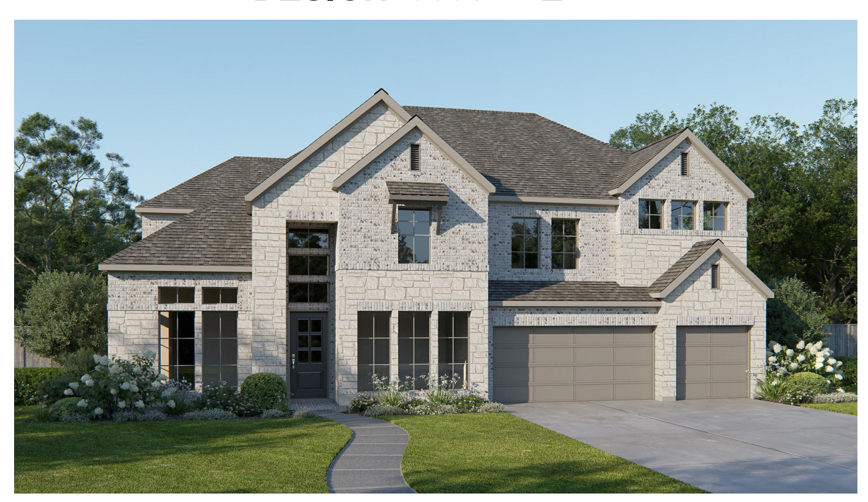
DESIGN 3658W E-70