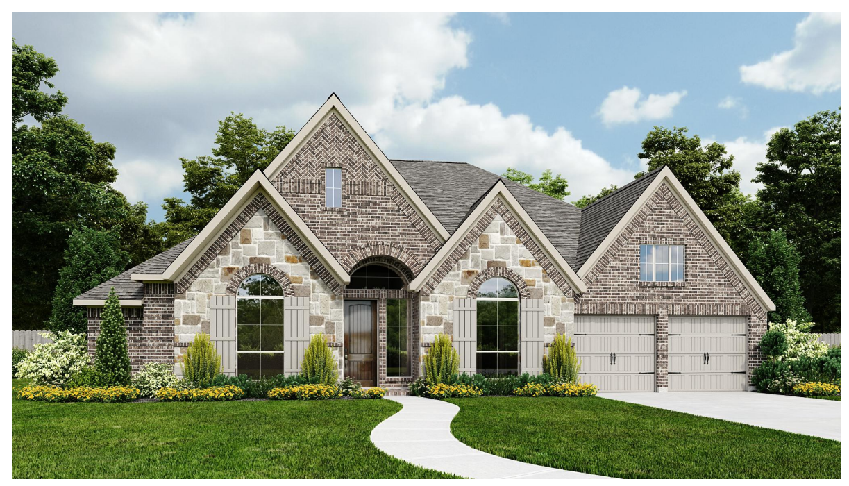
DESIGN 3714W E-72