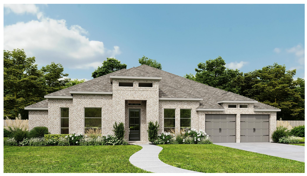
DESIGN 3714W E-1