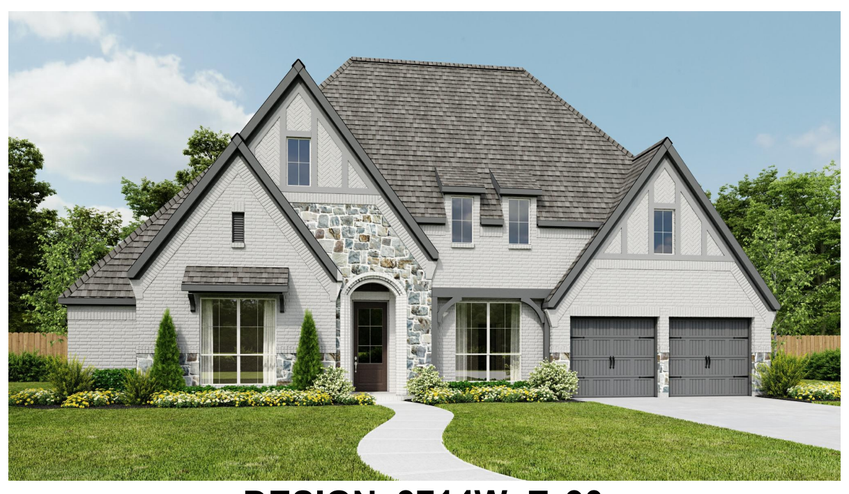
DESIGN 3714W E-90

range soliginally designed and prior to any changes you make, is estimated to yield approximately the number of square feet shown on page 1. All dimensions are approximately stream of year page 1. All dimensions, configurations, plan options and/or the method of calculation. Designs are not-to-scale, and are conceptual illustrations that may differ from construction plans or completed improvements. A design may depict features not available on all homesites or in all communities. Perry Homes reserves the right to make changes in plans and specifications, and to substitute material of similar quality. Prices, terms, promotions, plans, dimensions, features, options, amenities, elevations, designs, square footages, specifications, materials, and availability of homes or communities are subject to change without notice or obligation. All obligations will be governed by a written contract. This design does not constitute a commitment to build a particular floor plan or home in any given community Some floor plans, options, and/or elevations may not be available on certain homesites or in a particular community and may require additional charges. Please check with Perry Homes to verify current offerings in the communities you are considering. This rendering is the property of Perry Homes, LLC. Any reproduction or exhibition is strictly prohibited. © Perry Homes, LLC 2023