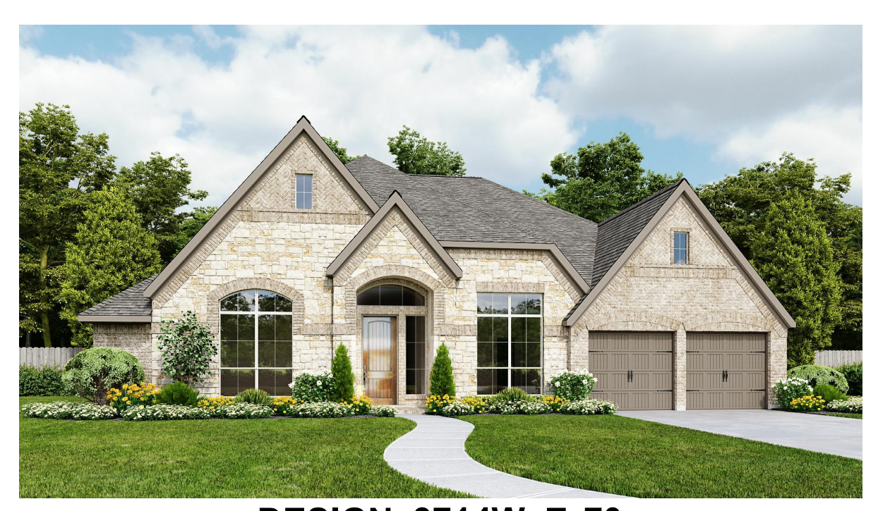
DESIGN 3714W E-70