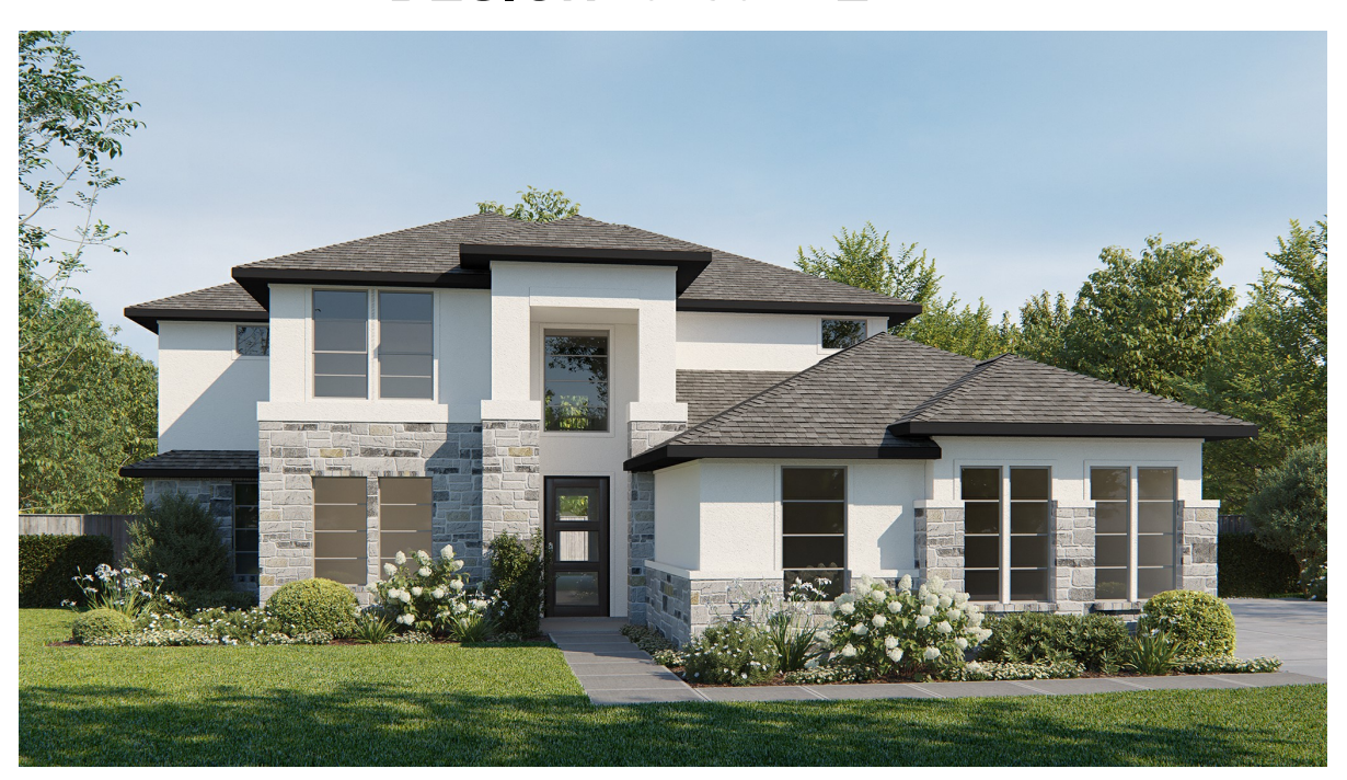
DESIGN 3786A E-2