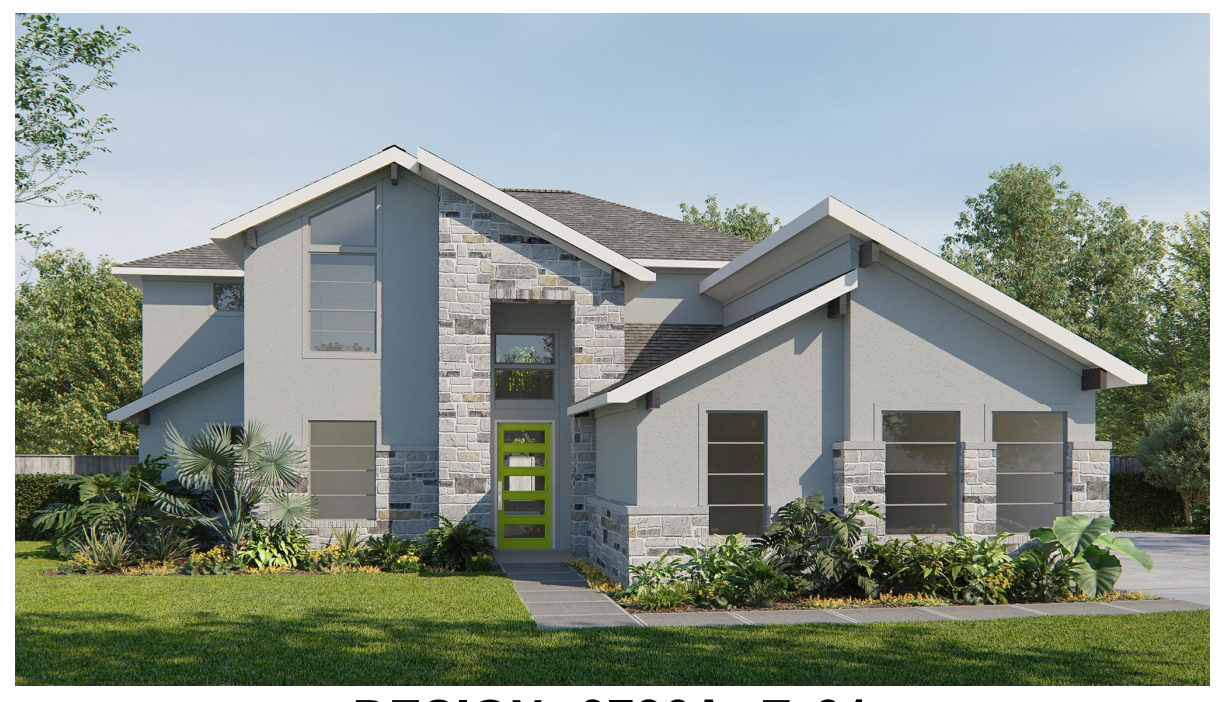
DESIGN 3786A E-31

This design, as originally designed and prior to any changes you make, is estimated to yield approximately the number of square feet shown on page 1. All dimensions are approximate. Square footage may vary based on as-built dimensions, configurations, plan options and/or the method of calculation. Designs are not-to-scale, and are conceptual illustrations that may differ from construction plans or completed improvements. A design may depict features not available on all homesites or in all communities. Perry Homes reserves the right to make changes in plans and specifications, and to substitute material of similar quality. Prices, terms, promotions, plans, dimensions, features, options, amenities, elevations, designs, square footages, specifications, materials, and availability of homes or communities evaluate to change without notice or obligation. All obligations will be governed by a written contract. This design does not constitute a commitment to build a particular floor plan or home in any given community. Some floor plans, options, and/or elevations may not be available on certain homesites or in a particular community and may require additional charges. Please check with Perry Homes to verify current offerings in the communities you are considering. This rendering is the property of Perry Homes. LLC. Any reproduction or exhibition is strictly prohibited. © Perry Homes. LLC 2023