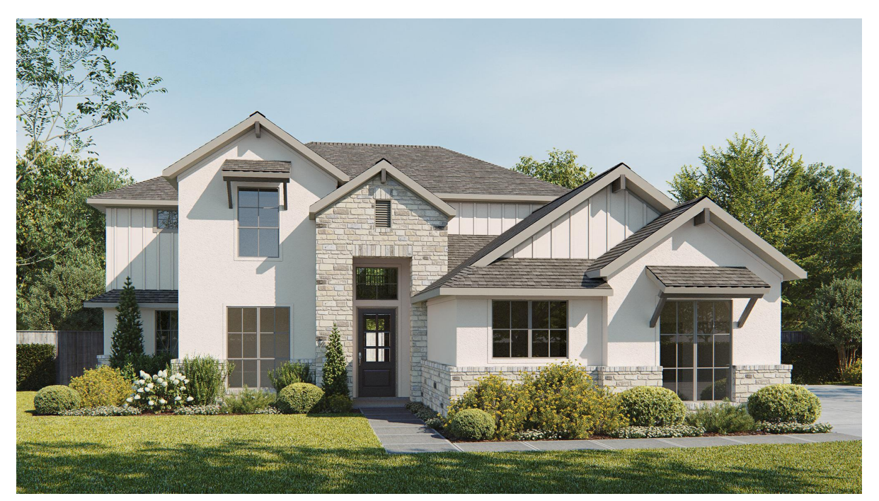
DESIGN 3786A E-1