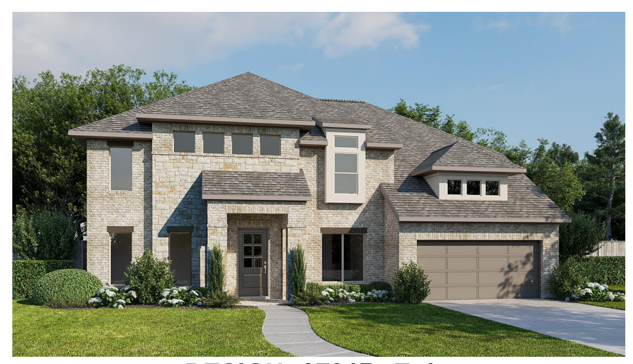
DESIGN 3791P E-1