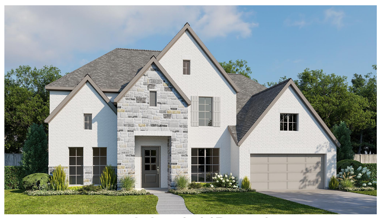
DESIGN 3791P E-50

This design, as originally designed and prior to any changes you make, is estimated to yield approximately the number of square feet shown on page 1. All dimensions are approximate. Square footage may repose the same page on as-built dimensions, configurations, plan options and/or the method of calculation. Designs are not-to-scale, and are conceptual illustrations that may differ from construction plans or completed improvements. A design may depict features not available on all homesites or in all communities. Perry Homes reserves the right to make changes in plans and specifications, and to substitute material or similar quality. Prices, terms, promotions, plans, dimensions, features, options, amenities, elevations, designs, square footages, specifications, materials, and availability of homes or communities are subject to change without notice or obligation. All obligations will be governed by a written contract. This design does not constitute a communitment to build a particular floor plan or home in any given community. Some floor plans, options, and/or elevations may not be available on certain homesites or in a particular community and may require additional charges. Please check with Perry Homes to verify current offerings in the communities you are considering. This rendering is the property of Perry Homes. LLC. Any reproduction or exhibition is strictly prohibited. @ Perry Homes LLC.