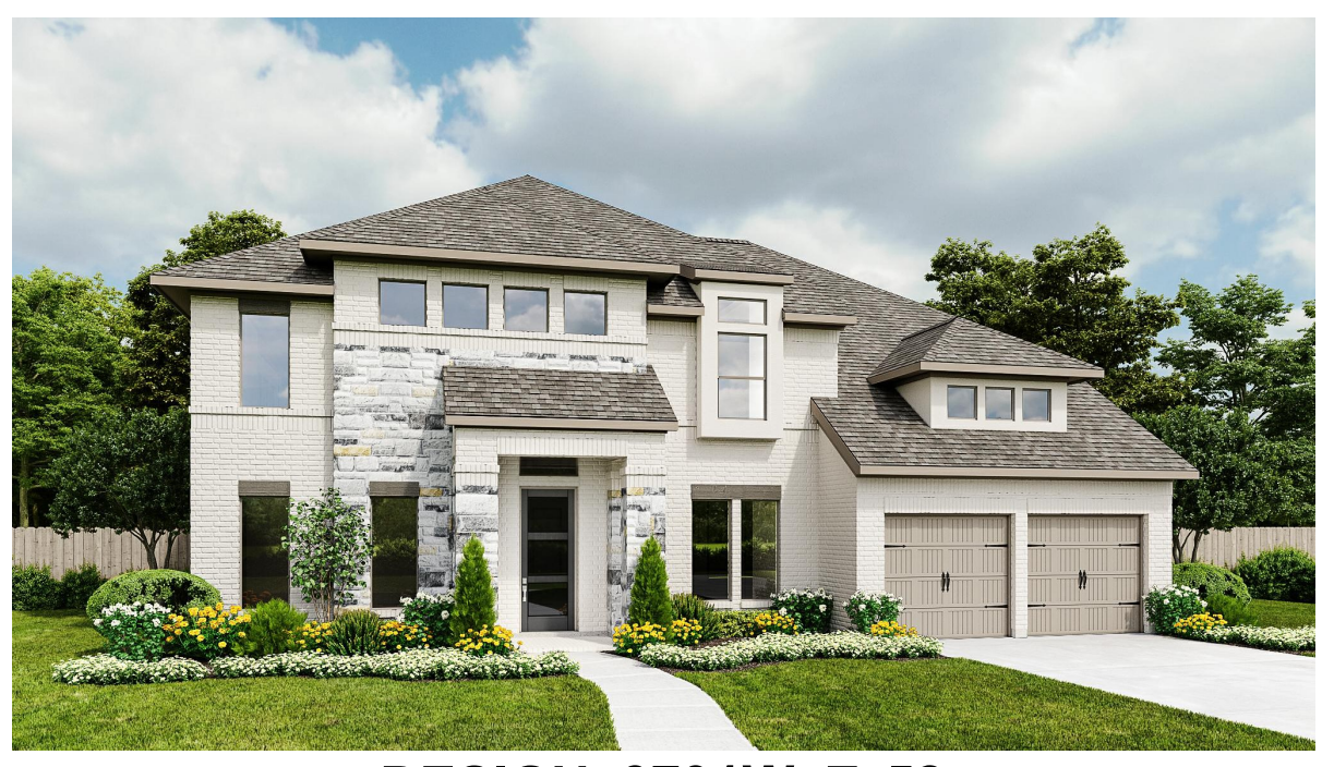
DESIGN 3791W E-52