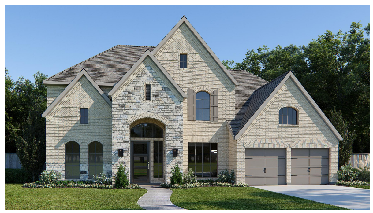
DESIGN 3791W E-72