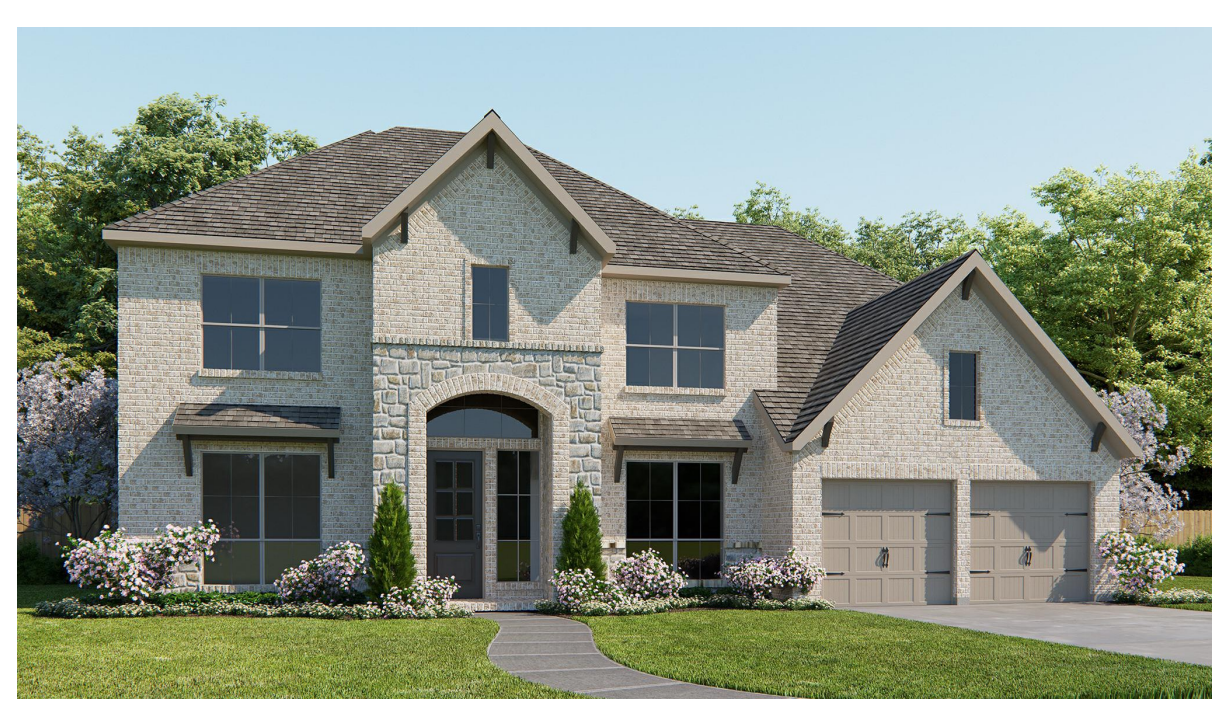
DESIGN 3791W E-30