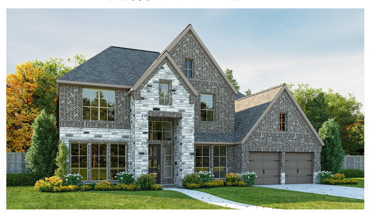
DESIGN 3791W E-74