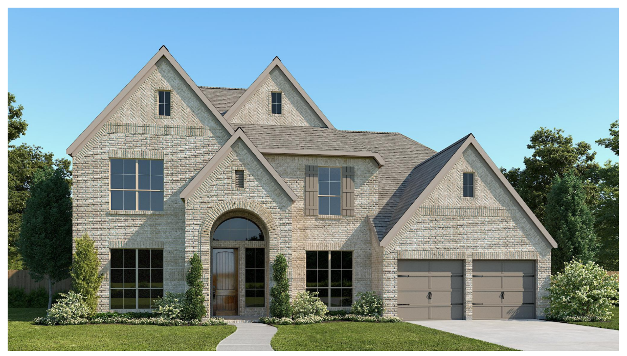
DESIGN 3791W E-1