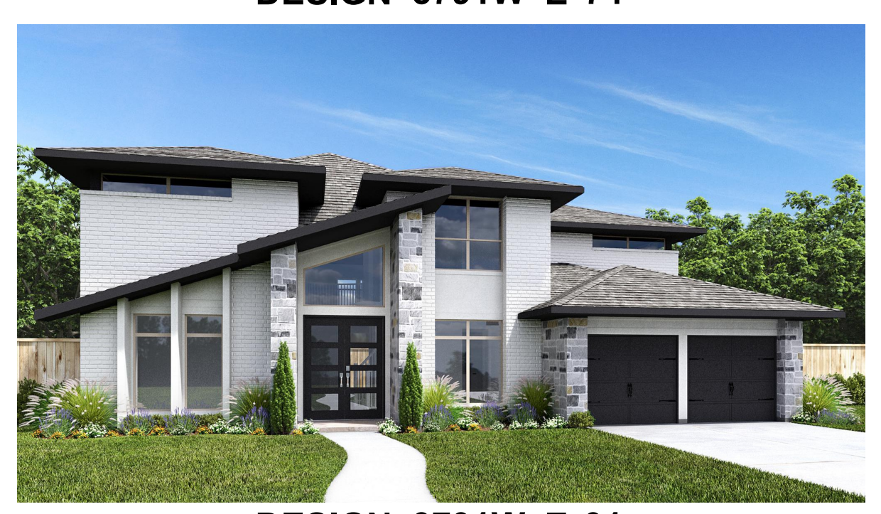
DESIGN 3791W E-91

This design, as originally designed and prior to any changes you make, is estimated to yield approximately the number of square feet shown on page 1. All dimensions are approximate. Square footage may vary based on as-built dimensions, configurations, plan options and/or the method of calculation. Designs are not-to-scale, and are conceptual illustrations that may differ from construction plans or completed improvements. A design may depict features not available on all homesites or in all communities. Perry Homes reserves the right to make changes in plans and specifications, and to substitute material of similar quality. Prices, terms, promotions, plans, dimensions, features, options, amenities, elevations, designs, square footages, specifications, materials, and availability of homes or communities to change without notice or obligation. All obligations will be governed by a written contract. This design does not constitute a commitment to build a particular floor plan or home in any given community. Some floor plans, options, and/or elevations may not be available on certain homesites or in a particular community and may require additional charges. Please check with Perry Homes to verify current offerings in the communities on are considering. This rendering is the property of Perry Homes. LLC. Any reproduction or exhibition is strictly prohibited @ Perry Homes LLC. 2018