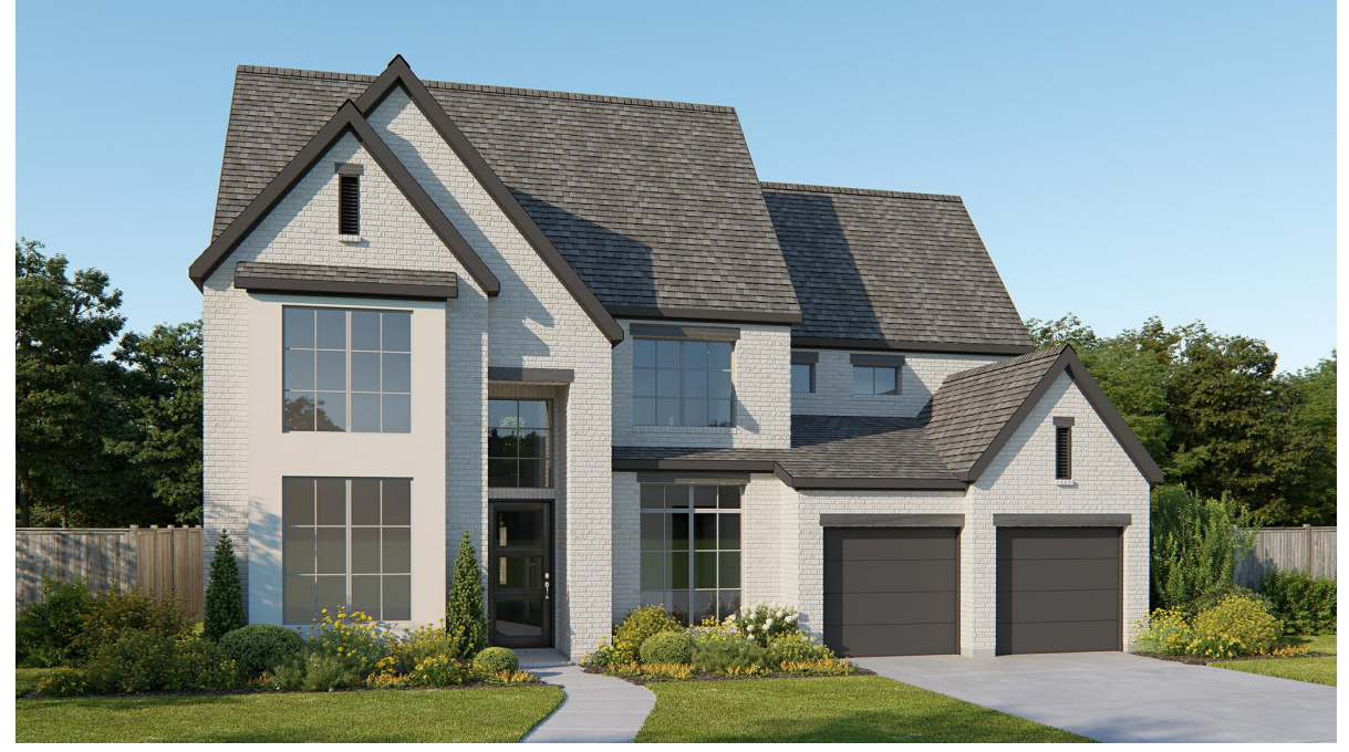
DESIGN 3800W E-1