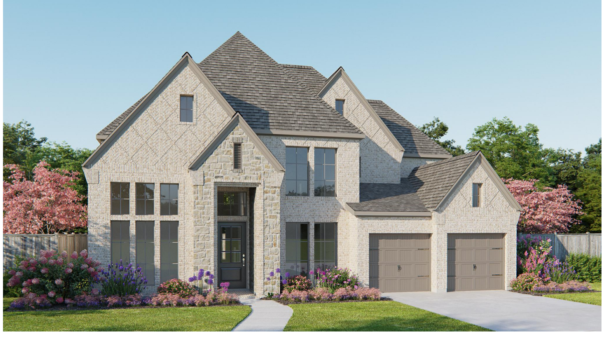
DESIGN 3800W E-30