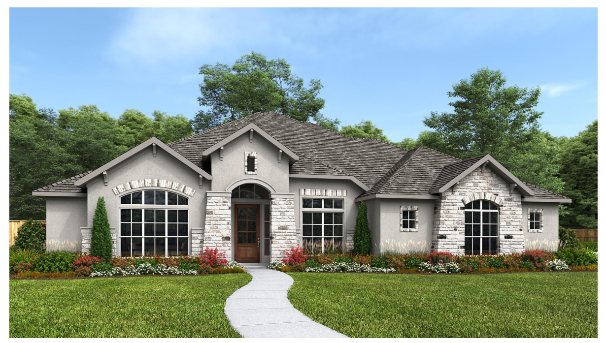
DESIGN 3860A E-1