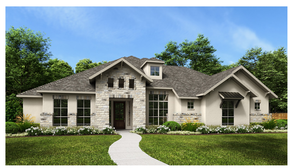
DESIGN 3860A E-30