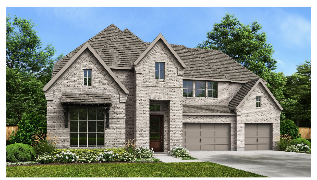
DESIGN 3896W E-1