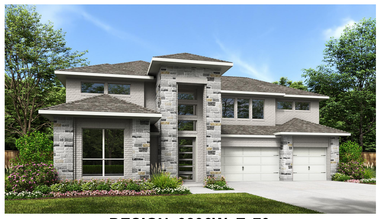
DESIGN 3896W E-70

This design, as originally designed and prior to any changes you make, is estimated to yield approximately the number of square feet shown on page 1. All dimensions are approximate. Square footage may vary based on as-built dimensions, configurations, plan options and/or the method of calculation. Designs are not-to-scale, and are conceptual illustrations that may differ from construction plans or completed improvements. A design may depict features not available on all homesites or in all communities. Perry Homes reserves the right to make changes in plans and specifications, and to substitute material of similar quality. Prices, terms, promotions, plans, dimensions, features, options, amenities, elevations, designs, square footages, specifications, materials, and availability of homes or communities to change without notice or obligation. All obligations will be governed by a written contract. This design does not constitute a commitment to build a particular floor plan or home in any given community. Some floor plans, options, and/or elevations may not be available on certain homesites or in a particular community and may require additional charges. Please check with Perry Homes to verify current offerings in the communities on a green considering. This rendering is the property of Perry Homes. LLC. Any reproduction or exhibition is strictly prohibited @ Perry Homes LLC. 2018