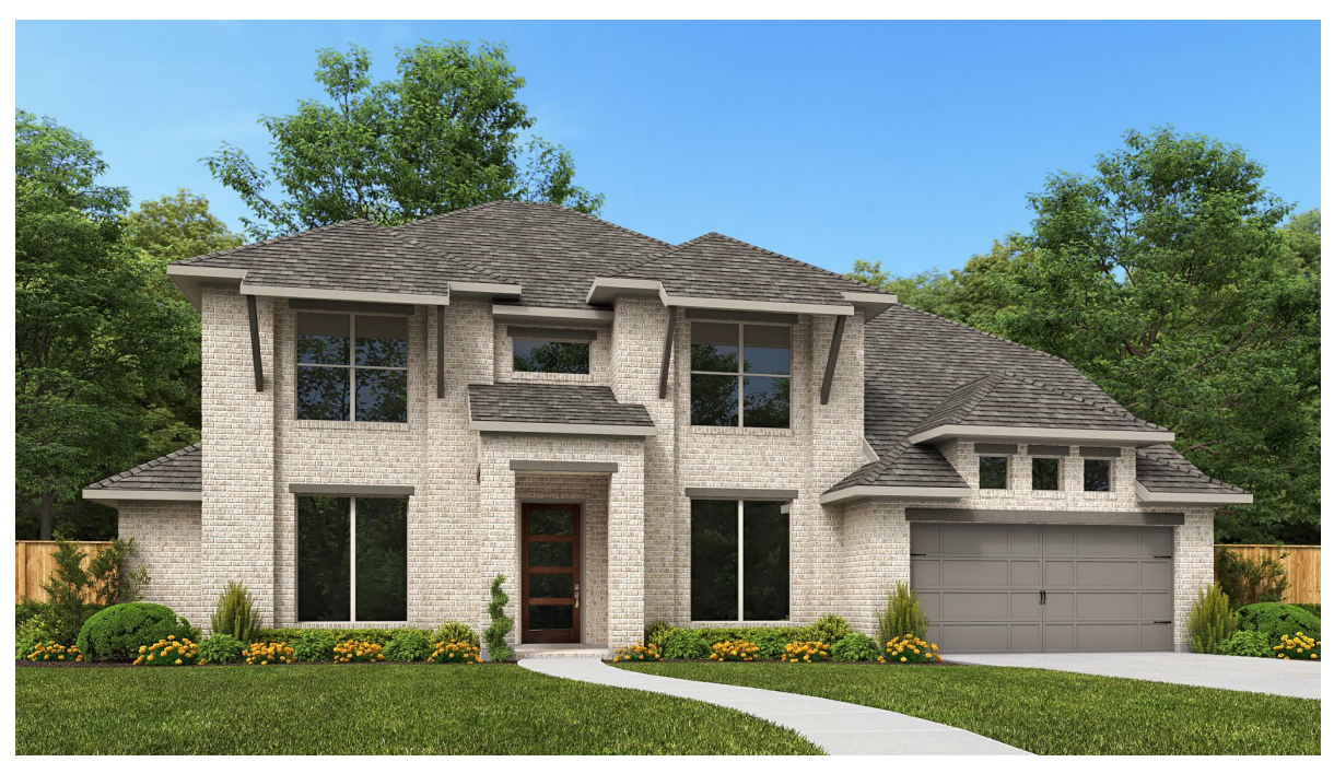
Design 3917P E-1