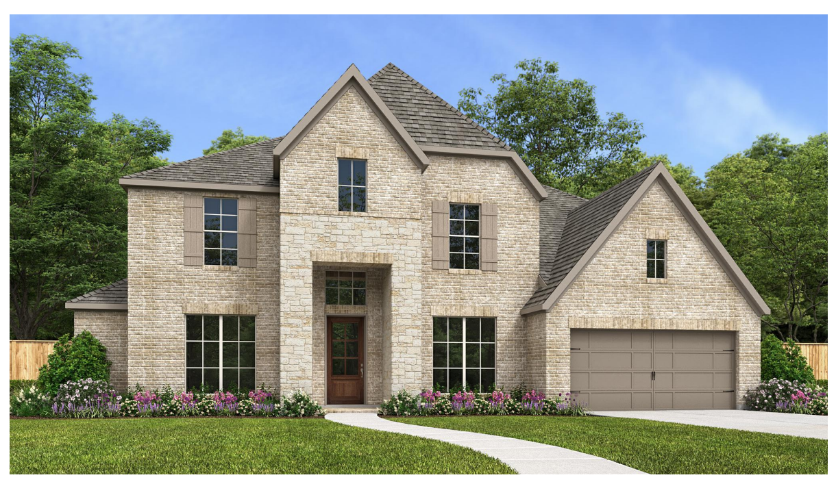
Design 3917P E-30

In sesignt, as originarily designed and prior to any charges you make, is estimated to yield approximately fire further of square reox, stourn of page 1. All dimensions are approximate. Square rook vary based on as-built dimensions, configurations, plan options and/or the method of calculation. Designs are not-to-scale, and are conceptual illustrations that may depict features not available on all homesites or in all communities. Perry Homes reserves the right to make changes in plans and specifications, and to substitute material of similar quality. Prices, terms, promotions, plans, dimensions, features, options, amenities, elevations, designs, square footages, specifications, materials, and availability of homes or communities are subject to change without notice or obligation. All obligations will be governed by a written contract. This design does not constitute a commitment to build a particular floor plan or home in any given community. Some floor plans, options, and/or elevations may not be available on certain homesites or in a particular community and may require additional charges. Please check with Perry Homes to verify current offerings in the communities you are considering. This rendering is the property of Perry Homes, LLC. Any reproduction or exhibition is strictly prohibited. © Perry Homes, LLC 2023