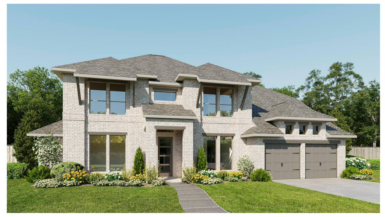
DESIGN 3917W E-1