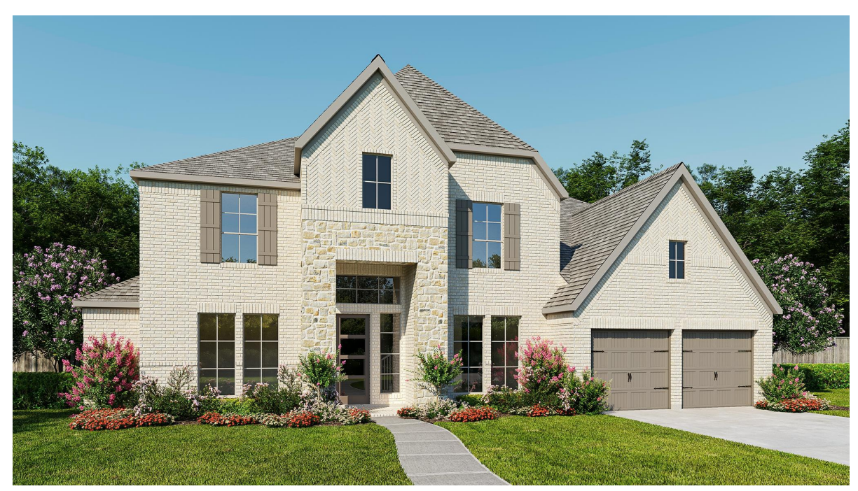
DESIGN 3917W E-30