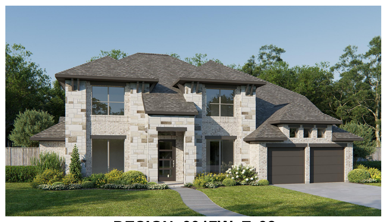
DESIGN 3917W E-32