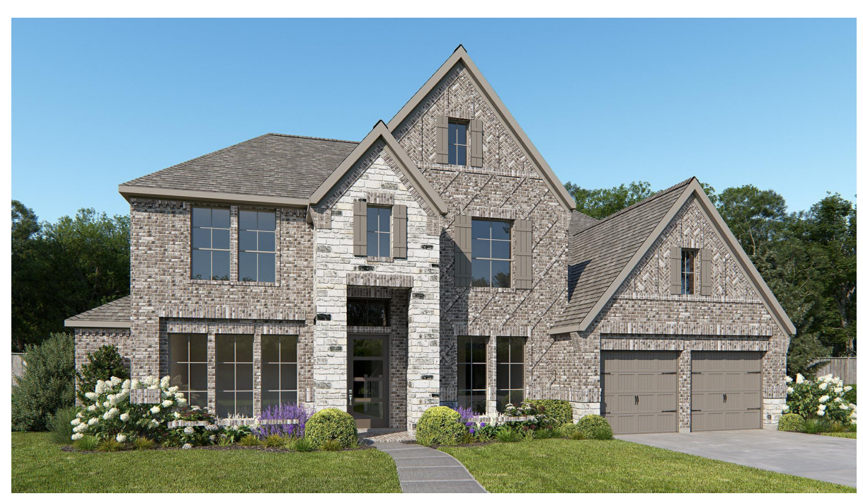
DESIGN 3917W E-90

This design, as originally designed and prior to any changes you make, is estimated to yield approximately the number of square feet shown on page 1. All dimensions are approximate. Square footage may vary based on as-built dimensions, configurations, plan options and/or the method of calculation. Designs are not-to-scale, and are conceptual illustrations that may differ from construction plans or completed improvements. A design may depict features not available on all homesites or in all communities. Perry Homes reserves the right to make changes in plans and specifications, and to substitute material of similar quality. Prices, terms, promotions, plans, dimensions, features, options, amenities, elevations, designs, square footages, specifications, materials, and availability of homes or communities are subject to change without notice or obligation. All obligations will be governed by a written contract. This design does not constitute a commitment to build a particular floor plan or home in any given community some plans, options, and/or elevations may not be available on certain homesites or in a particular community and may require additional charges. Please check with Perry Homes to verify current offerings in the communities you are considering. This rendering is the property of Perry Homes, LLC. Any reproduction or exhibition is strictly prohibited. © Perry Homes, LLC 2023