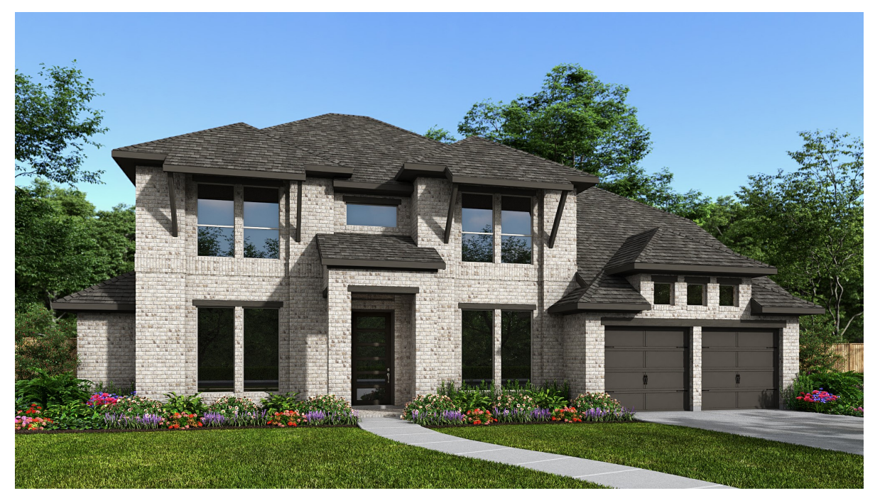
DESIGN 3917W E-1