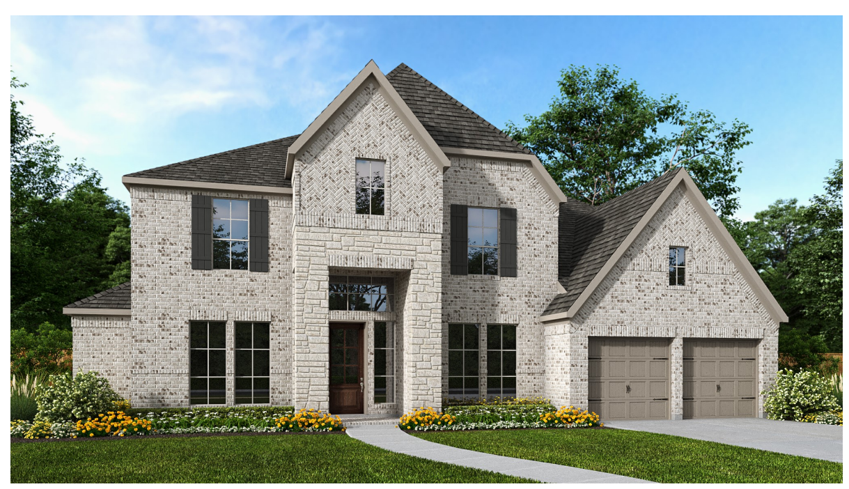
DESIGN 3917W E-30