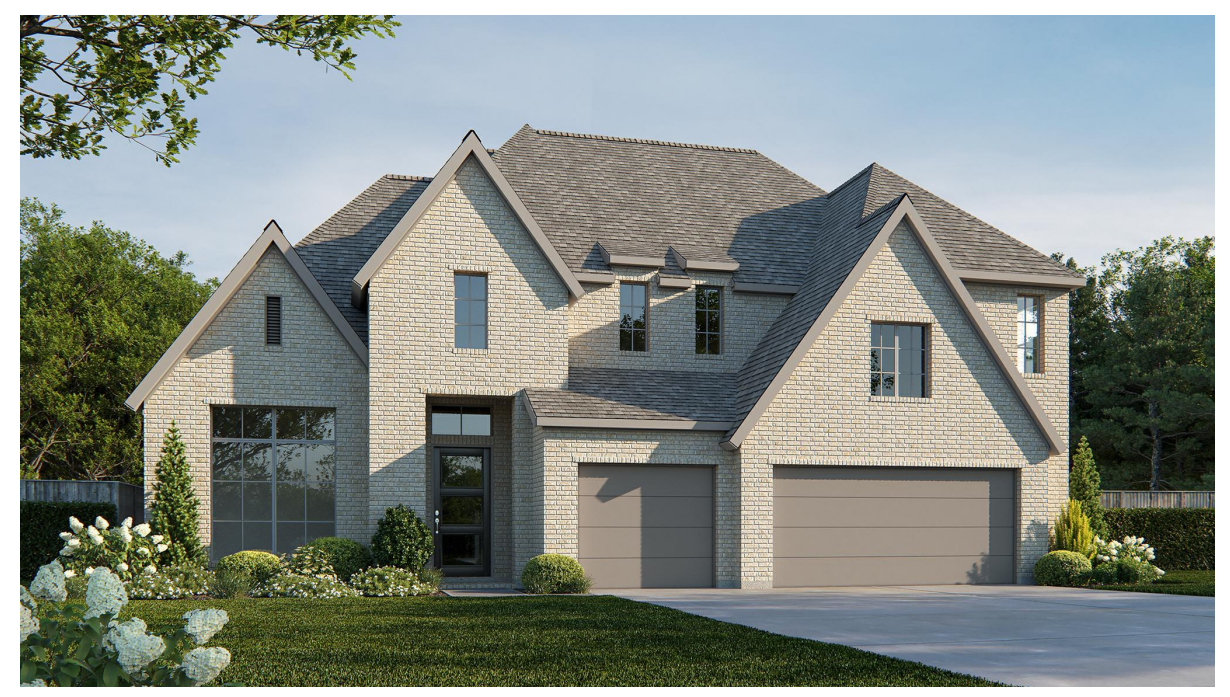
DESIGN 4054W E-1