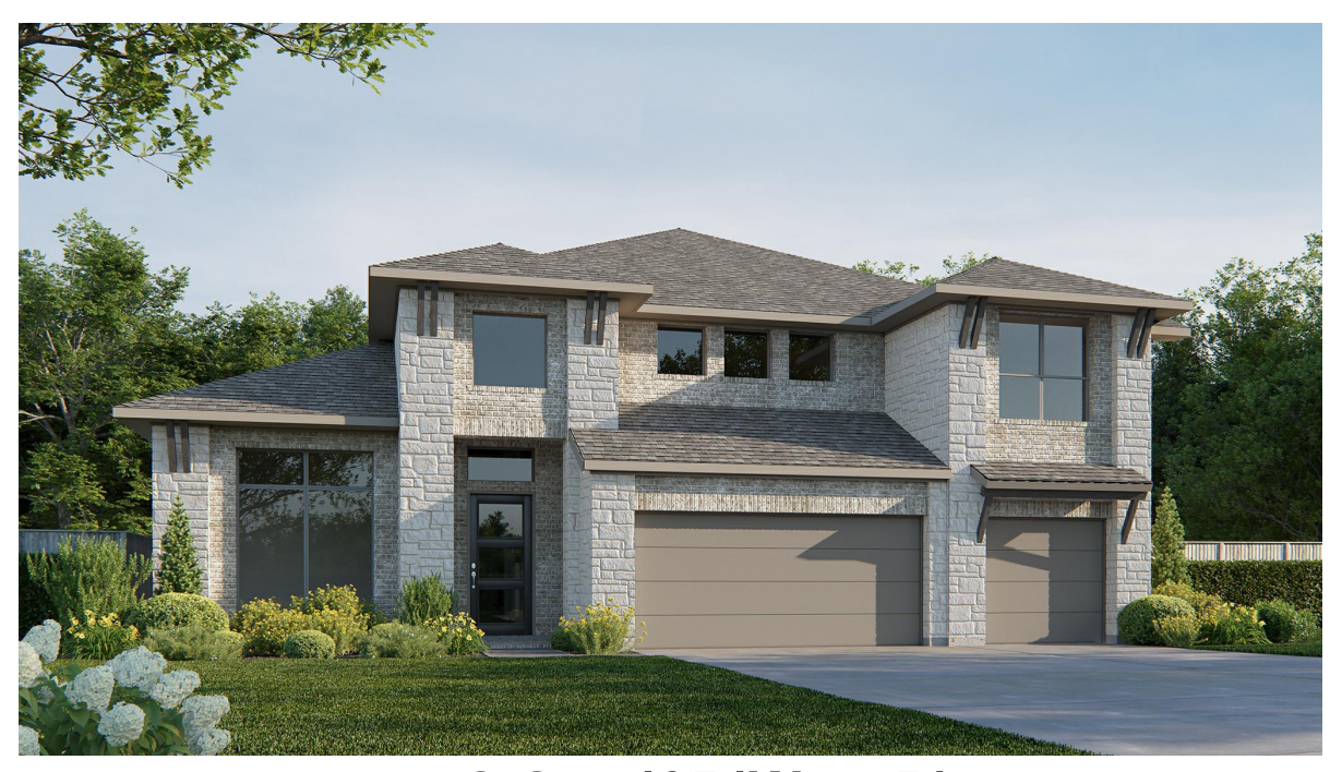
DESIGN 4054W E-51