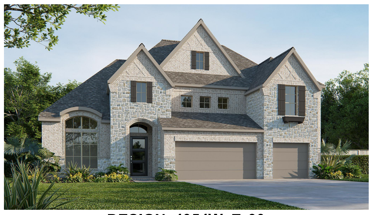
DESIGN 4054W E-90

This design, as originally designed and prior to any changes you make, is estimated to yield approximately the number of square feet shown on page 1. All dimensions are approximate. Square footage may vary based on as-built dimensions, configurations, plan options and/or the method of calculation. Designs are not-to-scale, and are conceptual illustrations that may differ from construction plans or completed improvements. A design may depict features not available on all homesites or in all communities. Perry Homes reserves the right to make changes in plans and specifications, and to substitute material of similar quality. Prices, terms, promotions, plans, dimensions, features, options, amenities, elevations, designs, square footages, specifications, materials, and availability of homes or communities are subject to change without notice or obligation. All obligations will be governed by a written contract. This design does not constitute a commitment to build a particular floor plan or home in any given community Some floor plans, options, and/or elevations may not be available on certain homesites or in a particular community and may require additional charges. Please check with Perry Homes to verify current offerings in the communities you are considering. This rendering is the property of Perry Homes LLC. Any reproduction or exhibition is strictly prohibited. @ Perry Homes LLC. 2013.