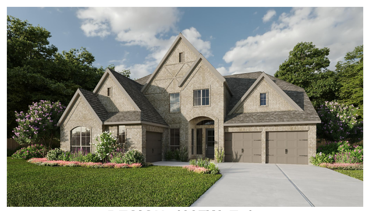
DESIGN 4097W E-1