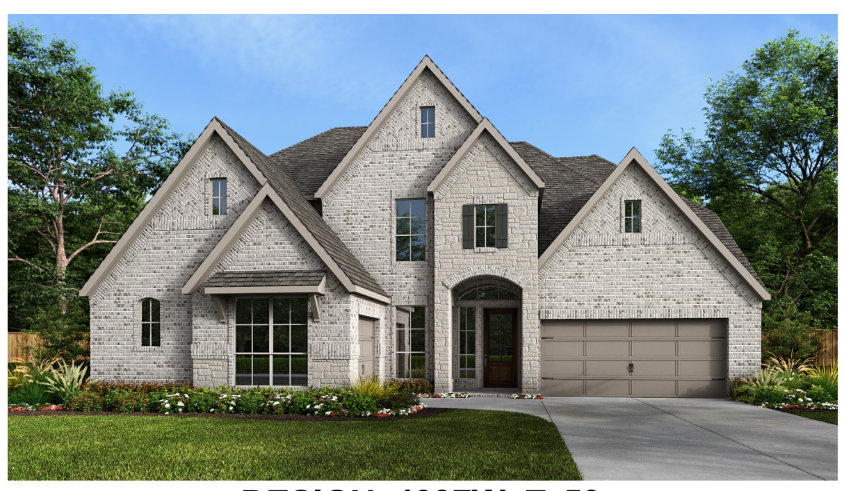
DESIGN 4097W E-50

This design, as originally designed and prior to any changes you make, is estimated to yield approximately the number of square feet shown on page 1. All dimensions are approximate. Square footage may vary based on as-built dimensions, configurations, plan options and/or the method of calculation. Designs are not-to-scale, and are conceptual illustrations that may differ from construction plans or completed improvements. A design may depict features not available on all homesites or in all communities. Perry Homes reserves the right to make changes in plans and specifications, and to substitute material of similar quality. Prices, terms, promotions, plans, dimensions, features, options, amenities, elevations, designs, square footages, specifications, materials, and availability of homes or communities are subject to change without notice or obligation. All obligations will be governed by a written contract. This design does not constitute a commitment to build a particular floor plan or home in any given community Some floor plans, options, and/or elevations may not be available on certain homesites or in a particular community and may require additional charges. Please check with Perry Homes to verify current offerings in the communities are considering. This rendering is the property of Perry Homes 11 C. Any reproduction or exhibition is strictly prohibited @ Perry Homes 11 C. 2023