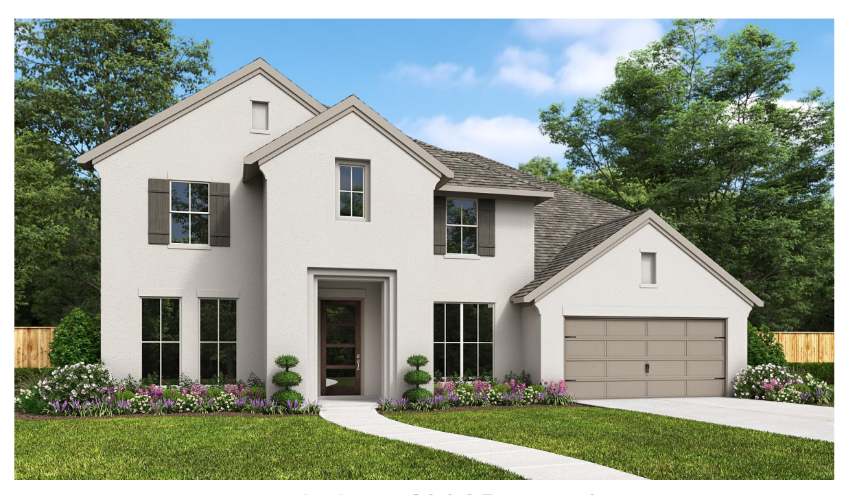
DESIGN 4098P E-70

This design, as originally designed and prior to any changes you make, is estimated to yield approximately the number of square feet shown on page 1. All dimensions are approximate. Square footage may vary based on as-built dimensions, configurations, plan options and/or the method of calculation. Designs are not-to-scale, and are conceptual illustrations that may differ from construction plans or completed improvements. A design may depict features not available on all homesites or in all communities. Perry Homes reserves the right to make changes in plans and specifications, and to substitute material of similar quality. Prices, terms, promotions, plans, dimensions, features, options, amenities, elevations, designs, square footages, specifications, materials, and availability of homes or communities are subject to change without notice or obligation. All obligations will be governed by a written contract. This design does not constitute a commitment to build a particular floor plan or home in any given community Some floor plans, options, and/or elevations may not be available on certain homesites or in a particular community and may require additional charges. Please check with Perry Homes to verify current offerings in the communities are considering. This rendering is the property of Perry Homes. LLC. Any reproduction or exhibition is strictly prohibited @ Perry Homes LLC. 2023