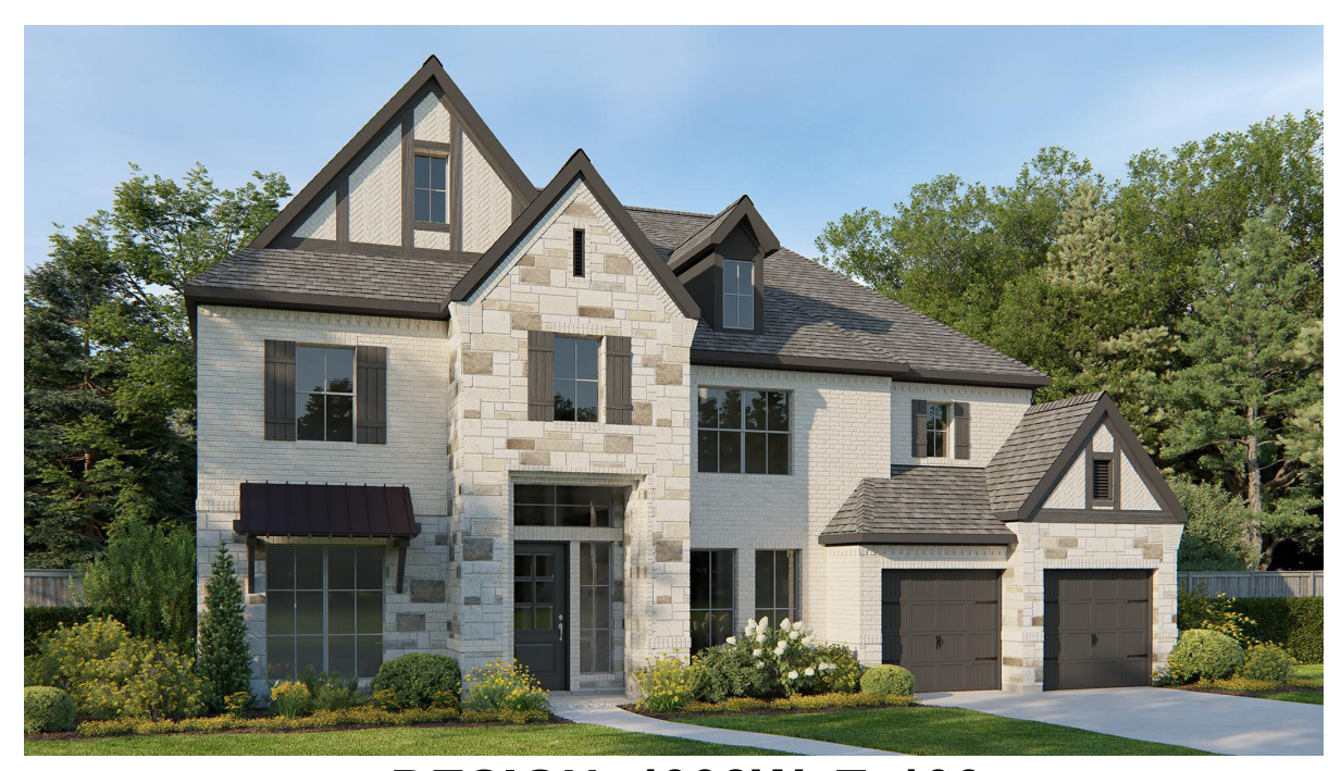
DESIGN 4098W E-100