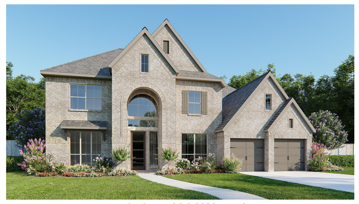
DESIGN 4098W E-1