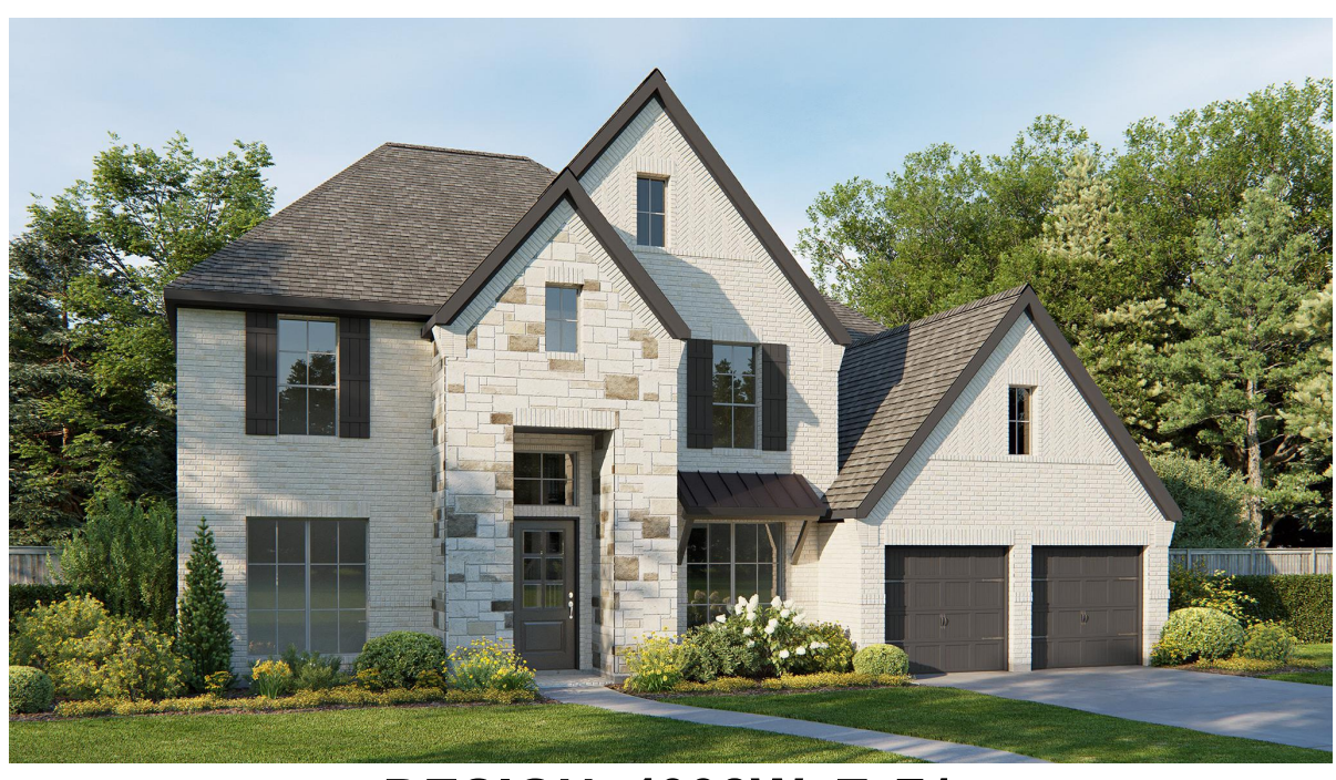
DESIGN 4098W E-71