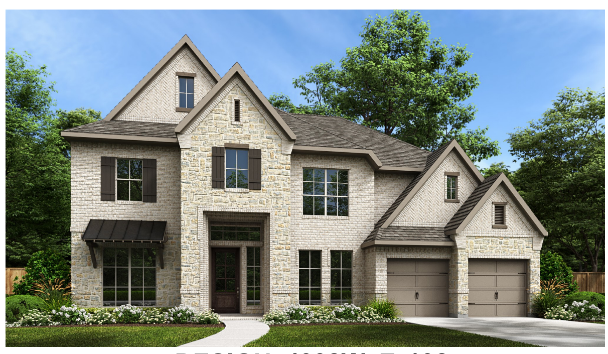
DESIGN 4098W E-102

This design, as originally designed and prior to any changes you make, is estimated to yield approximately the number of square feet shown on page 1. All dimensions are approximate. Square footage may a pased on as-built dimensions, configurations, plan options and/or the method of calculation. Designs are not-to-scale, and are conceptual illustrations that may differ from construction plans or completed improvements. A design may depict features not available on all homesites or in all communities. Perry Homes reserves the right to make changes in plans and specifications, and to substitute material or similar quality. Prices, terms, promotions, plans, dimensions, features, options, amenities, elevations, designs, square footages, specifications, materials, and availability of homes or communities are subject to change without notice or obligation. All obligations will be governed by a written contract. This design does not constitute a commitment to build a particular floor plan or home in any given community. Some floor plans, and/or elevations may not be available on certain homesites or in a particular community and may require additional charges. Please check with Perry Homes to verify current offerings in the communities you are considering. This rendering is the property of Perry Homes. LLC. Any reproduction or exhibition is strictly prophibited. @ Perry Homes LLC. 2024