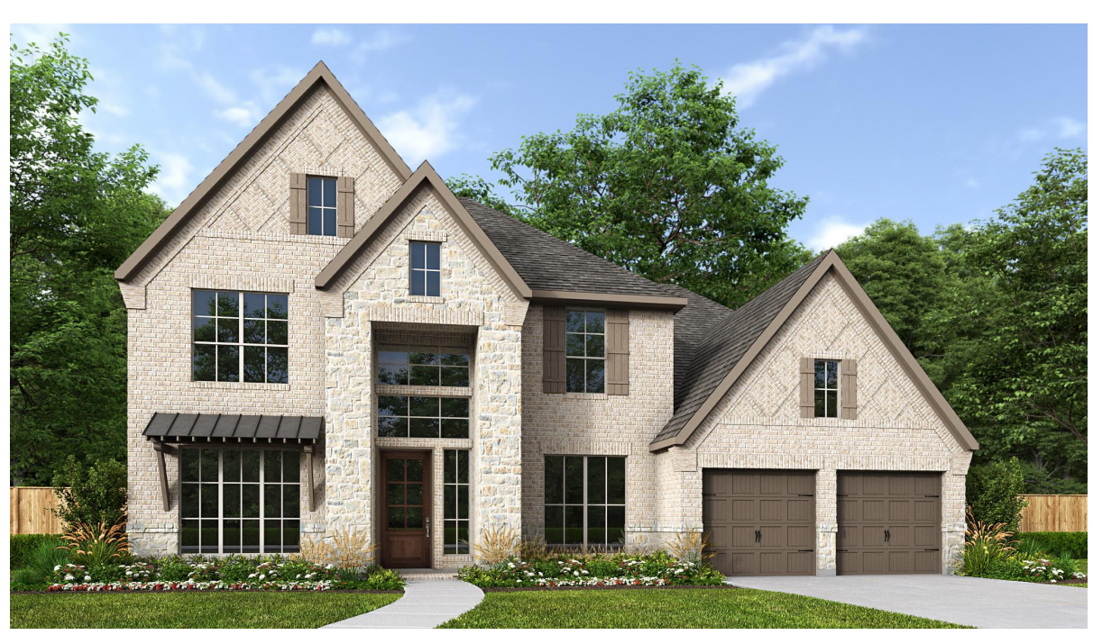
DESIGN 4098W E-93