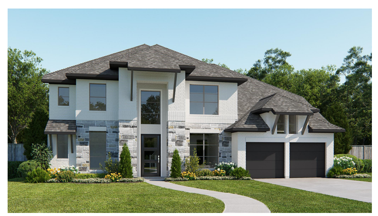
DESIGN 4098W E-31