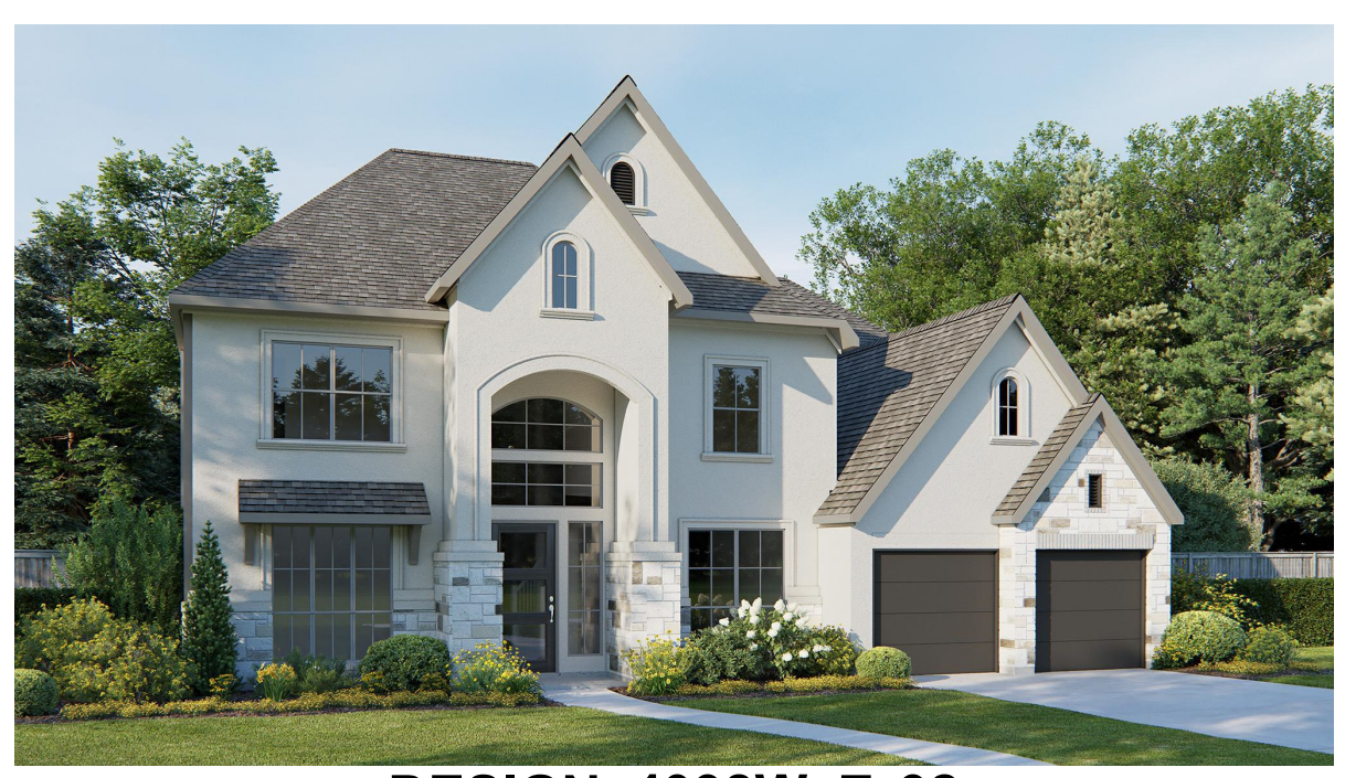
DESIGN 4098W E-92 Includes Stucco Front