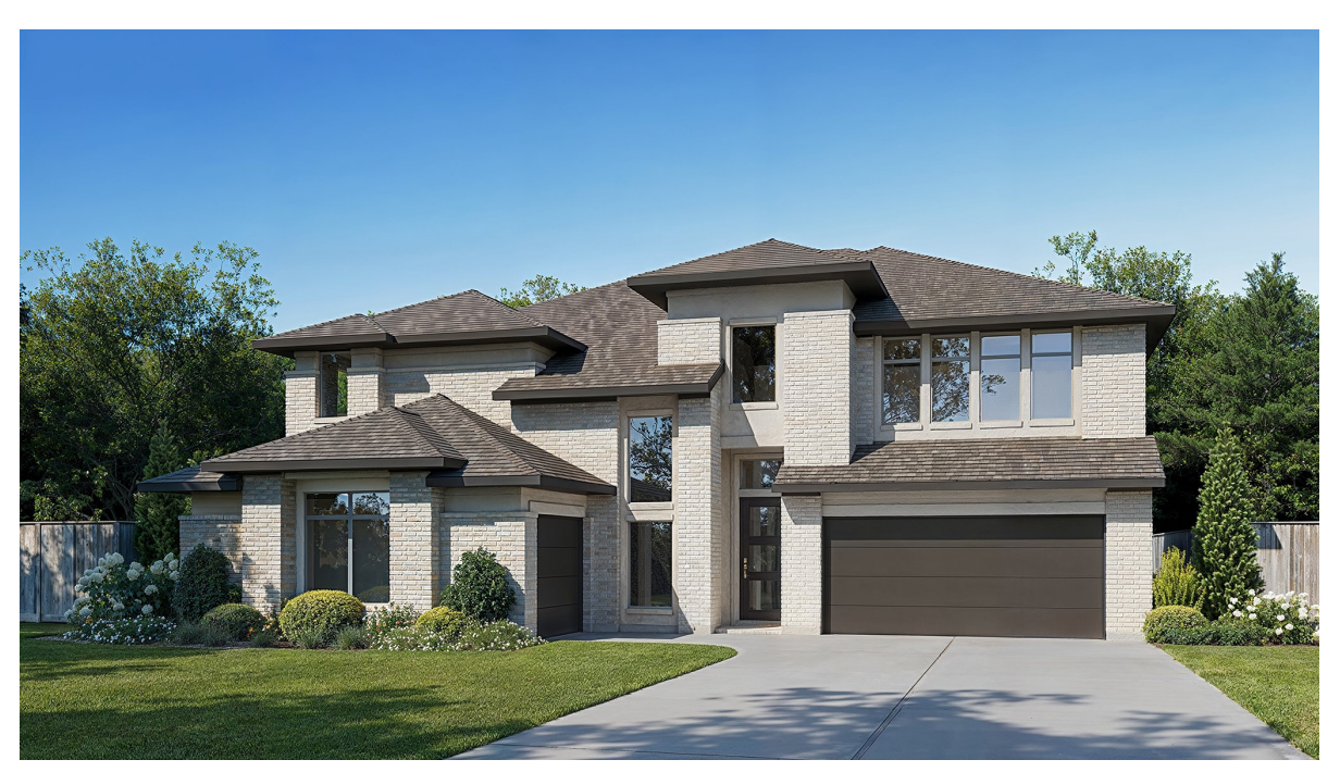
DESIGN 4140W E-50