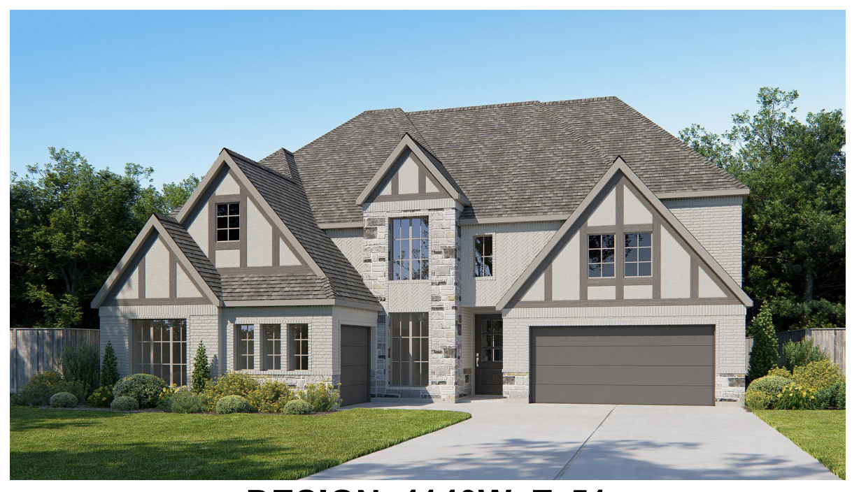
DESIGN 4140W E-51

This design, as originally designed and prior to any changes you make, is estimated to yield approximately the number of square feet shown on page 1. All dimensions are approximate. Square footage may vary based on as-built dimensions, configurations, plan options and/or the method of calculation. Designs are not-to-scale, and are conceptual illustrations that may differ from construction plans or completed improvements. A design may depict features not available on all homesites or in all communities. Perry Homes reserves the right to make changes in plans and specifications, and to substitute material of similar quality. Prices, terms, promotions, plans, dimensions, features, options, amenities, elevations, designs, square footages, specifications, materials, and availability of homes or communities to change without notice or obligation. All obligations will be governed by a written contract. This design does not constitute a commitment to build a particular floor plan or home in any given community. Some floor plans, options, and/or elevations may not be available on certain homesites or in a particular community and may require additional charges. Please check with Perry Homes to verify current offerings in the communities and are considering. This rendering is the property of Perry Homes. LLC. Any reproduction or exhibition is strictly prohibited @ Perry Homes LLC. 2019.