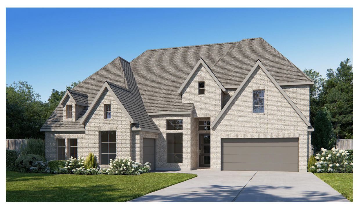
DESIGN 4140W E-1