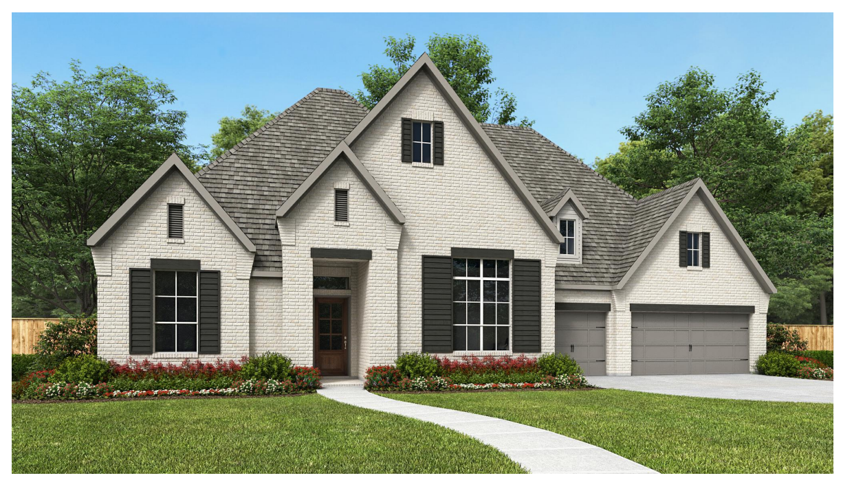
DESIGN 4179W E-1