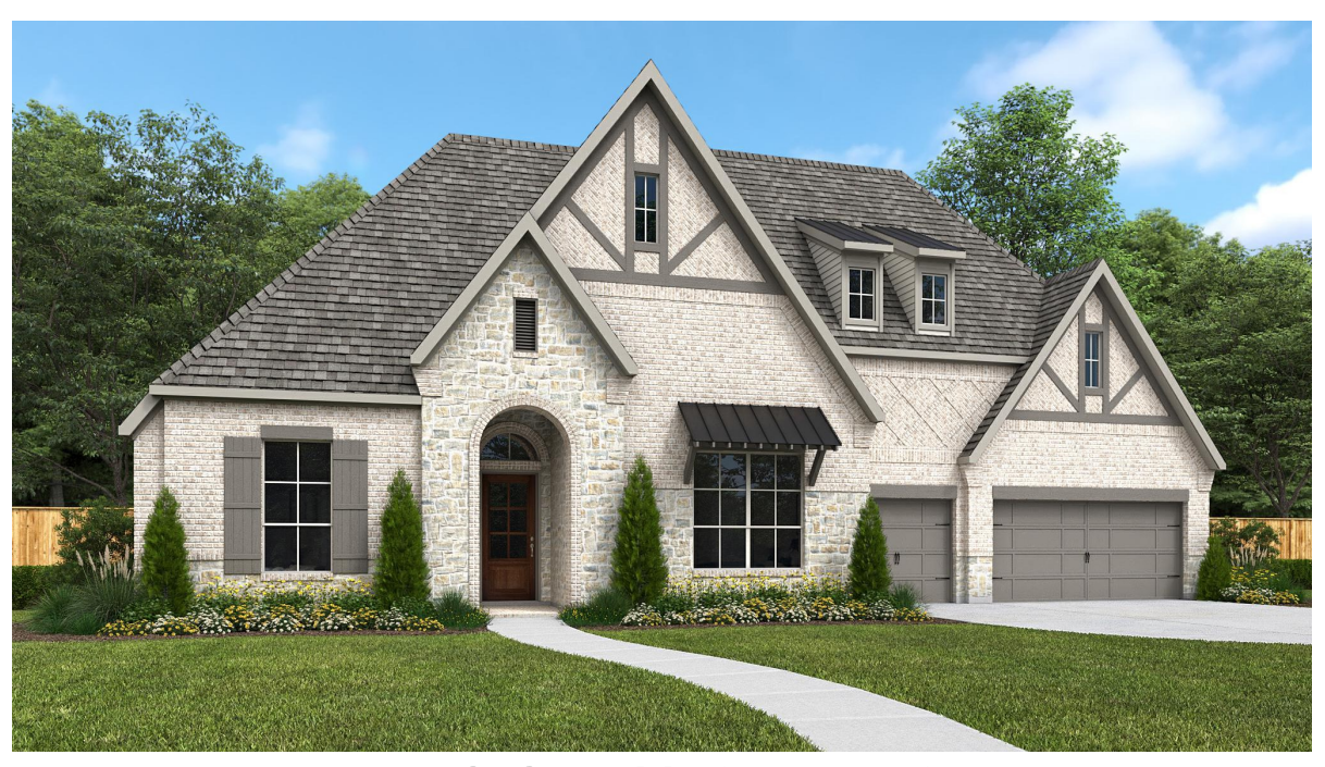
DESIGN 4179W E-70

Inis design, as originally designed and prior to any changes you make, is estimated to yield approximately the number of square feet shown on page 1. All dimensions are approximately expressed on as-built dimensions, configurations, plan options and/or the method of calculation. Designs are not-to-scale, and are conceptual illustrations that may differ from construction plans or completed improvements. A design may depict features not available on all homesites or in all communities. Perry Homes reserves the right to make changes in plans and specifications, and to substitute material of similar quality. Prices, terms, promotions, plans, dimensions, features, options, amenities, elevations, designs, square footages, specifications, materials, and availability of homes or communities are subject to change without notice or obligation. All obligations will be governed by a written contract. This design does not constitute a commitment to build a particular floor plan or home in any given community Some floor plans, options, and/or elevations may not be available on certain homesites or in a particular community and may require additional charges. Please check with Perry Homes to verify current offerings in the communities you are considering. This rendering is the property of Perry Homes, LLC. Any reproduction or exhibition is strictly prohibited. © Perry Homes, LLC 2023