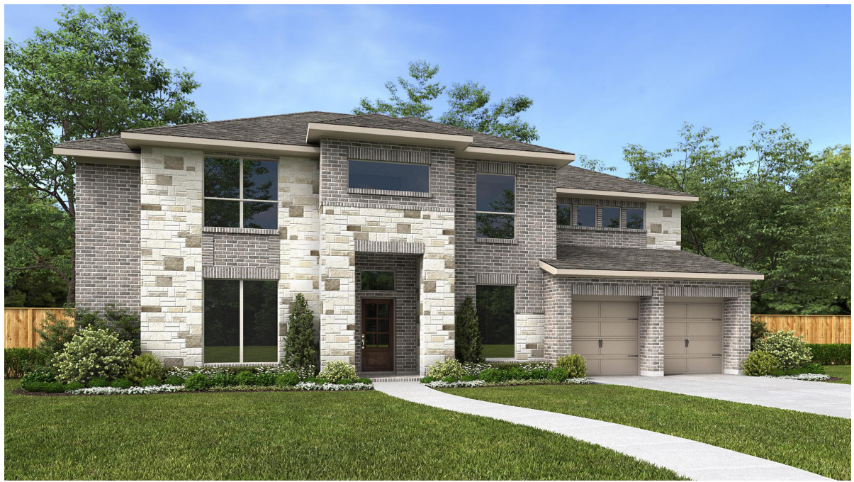
DESIGN 4190W E-52