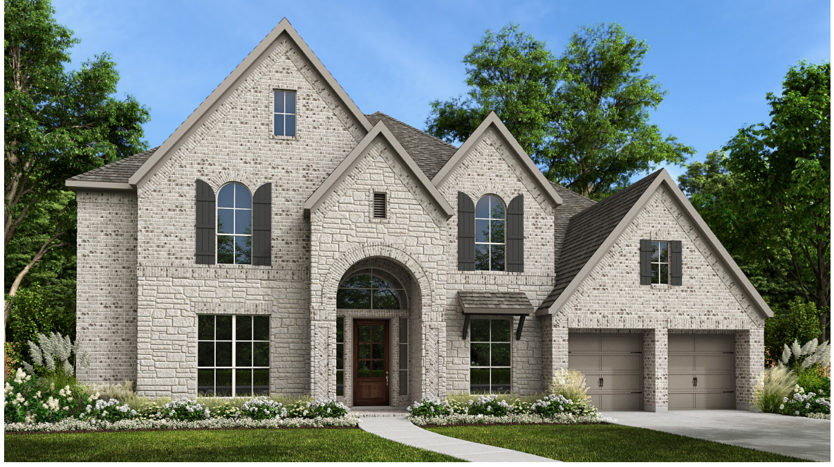
DESIGN 4190W E-70

*See Page 3 for Details and Disclaimers | © Perry Homes, LLC 2023 | 11/2/2023 3:59:00 PM (70' CL) PerryHomes.com