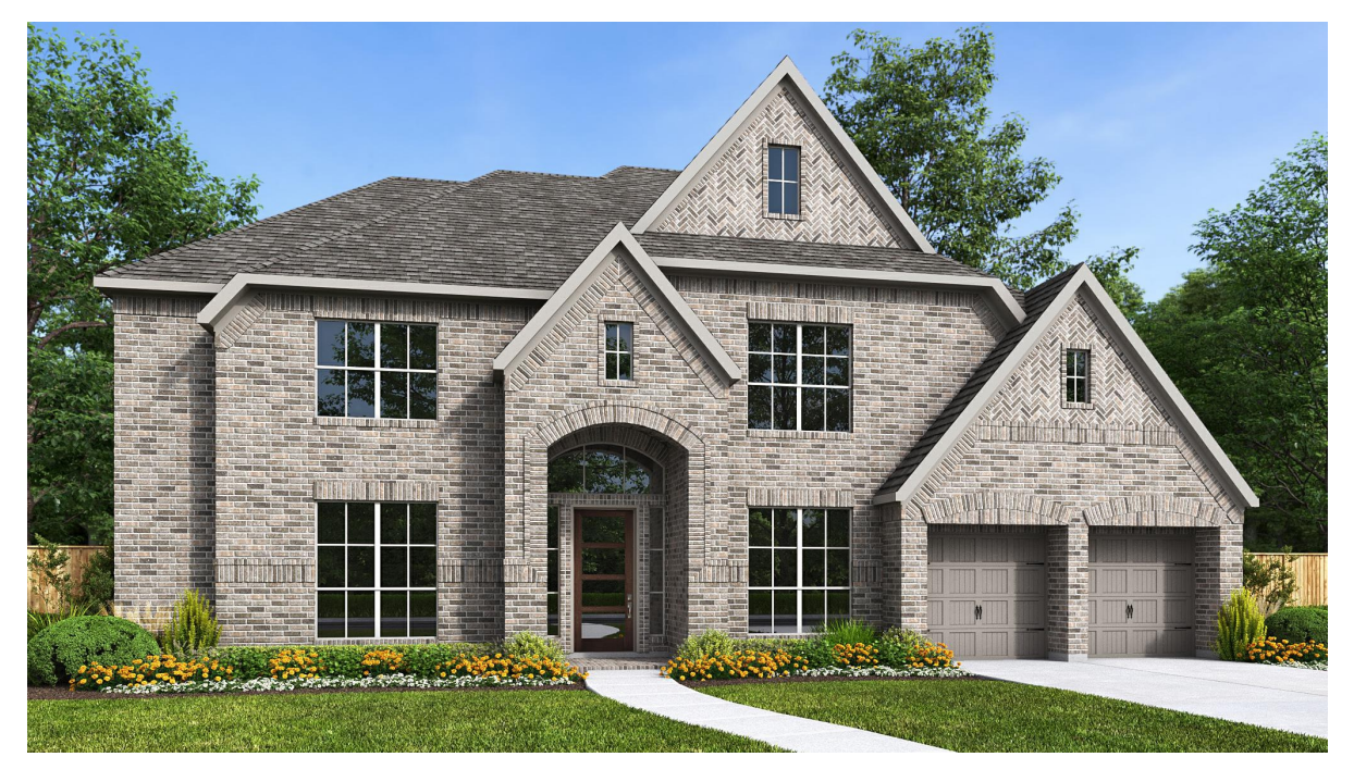
DESIGN 4190W E-1