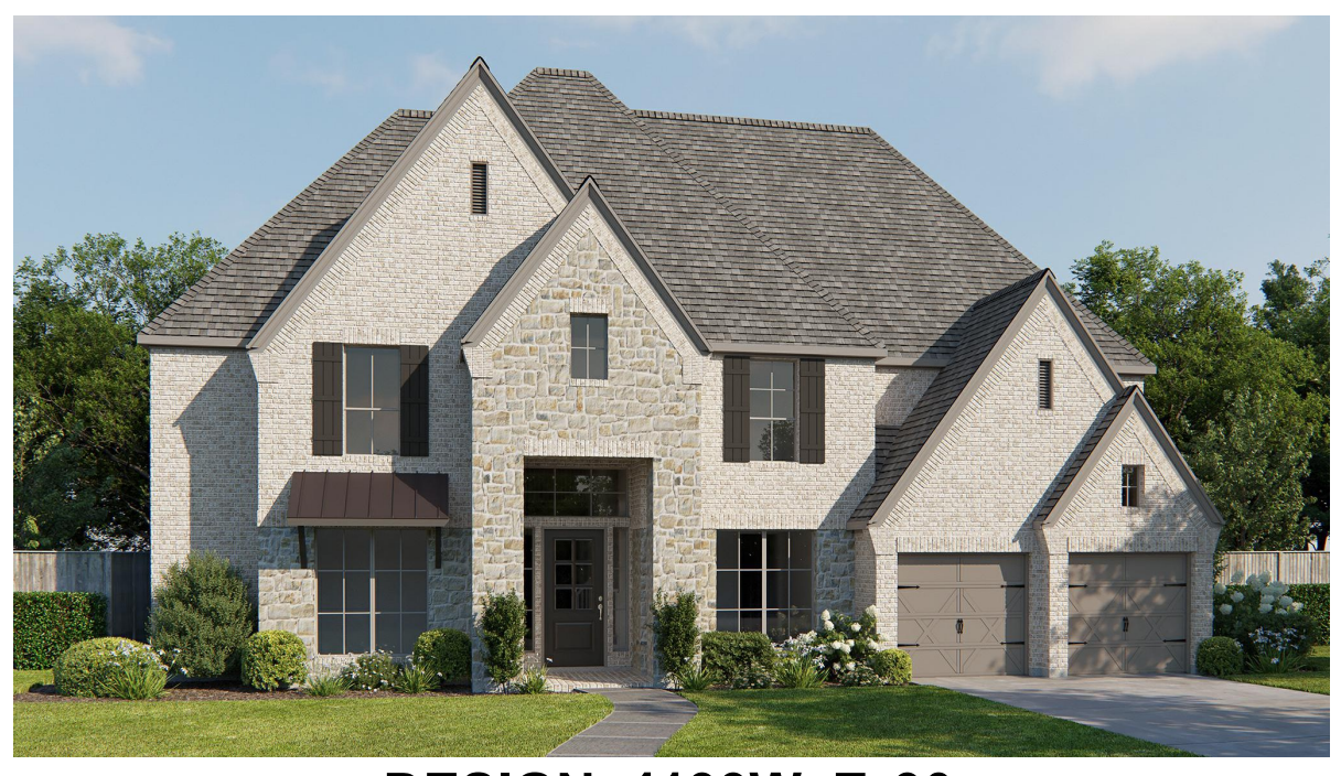
DESIGN 4199W E-90

This design, as originally designed and prior to any changes you make, is estimated to yield approximately the number of square feet shown on page 1. All dimensions are approximate. Square footage may vary based on as-built dimensions, configurations, plan options and/or the method of calculation. Designs are not-to-scale, and are conceptual illustrations that may differ from construction plans or completed improvements. A design may depict features not available on all homesites or in all communities. Perry Homes reserves the right to make changes in plans and specifications, and to substitute material of similar quality. Prices, terms, promotions, plans, dimensions, features, options, amenities, elevations, designs, square footages, specifications, materials, and availability of homes or communities to change without notice or obligation. All obligations will be governed by a written contract. This design does not constitute a commitment to build a particular floor plan or home in any given community. Some floor plans, options, and/or elevations may not be available on certain homesites or in a particular community and may require additional charges. Please check with Perry Homes to verify current offerings in the communities and are considering. This rendering is the property of Perry Homes. LLC. Any reproduction or exhibition is strictly prohibited @ Perry Homes LLC. 2019.