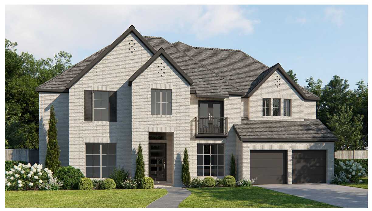
DESIGN 4199W E-1