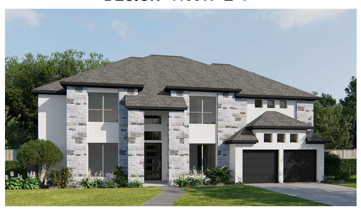
DESIGN 4199W E-51