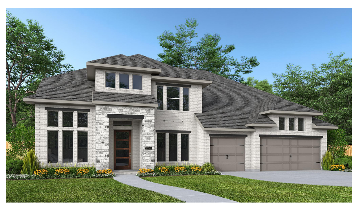
DESIGN 4263W E-30