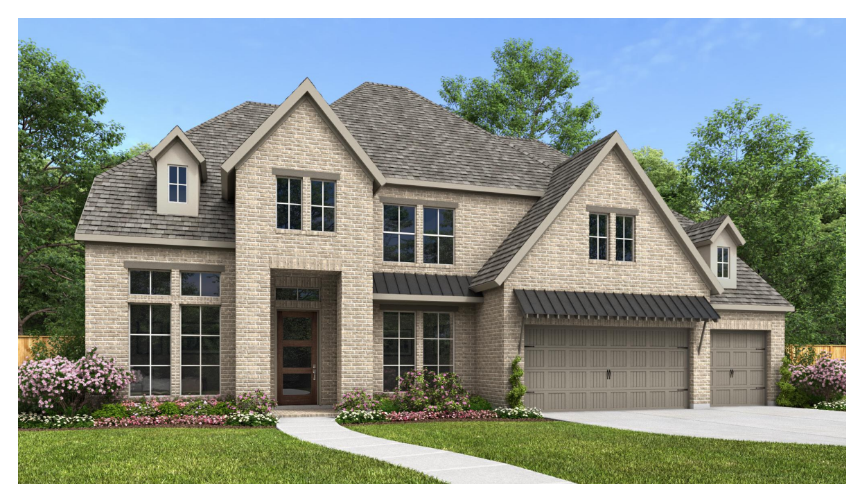
DESIGN 4263W E-1