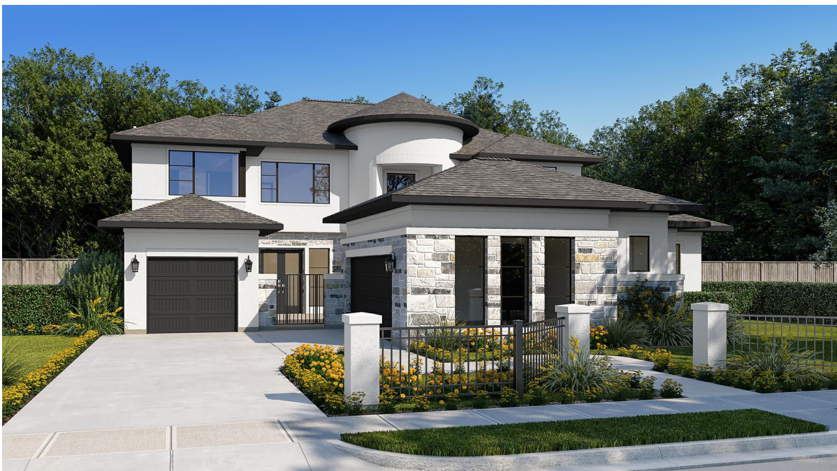
DESIGN 4377S E-3