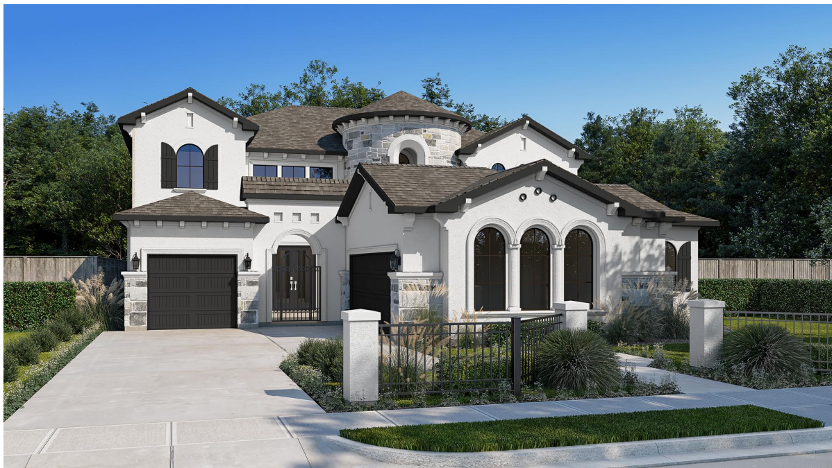
DESIGN 4377S E-90

This design, as originally designed and prior to any changes you make, is estimated to yield approximately the number of square feet shown on page 1. All dimensions are approximate. Square footage may vary based on as-built dimensions, configurations, plan options and/or the method of calculation. Designs are not-to-scale, and are conceptual illustrations that may differ from construction plans or completed improvements. A design may depict features not available on all homesites or in all communities. Perry Homes reserves the right to make changes in plans and specifications, and to substitute material of similar quality. Prices, terms, promotions, plans, dimensions, features, options, amenities, elevations, designs, square footages, specifications, materials, and availability of homes or communities are subject to change without notice or obligation. All obligations will be governed by a written contract. This design does not constitute a commitment to build a particular floor plan or home in any given community. Some floor plans, options, and/or elevations may not be available on certain homesites or in a particular community and may require additional charges. Please check with Perry Homes to verify current offerings in the communities you are considering. This rendering is the property of Perry Homes, LLC. Any reproduction or exhibition is strictly prohibited. © Perry Homes, LLC 2024