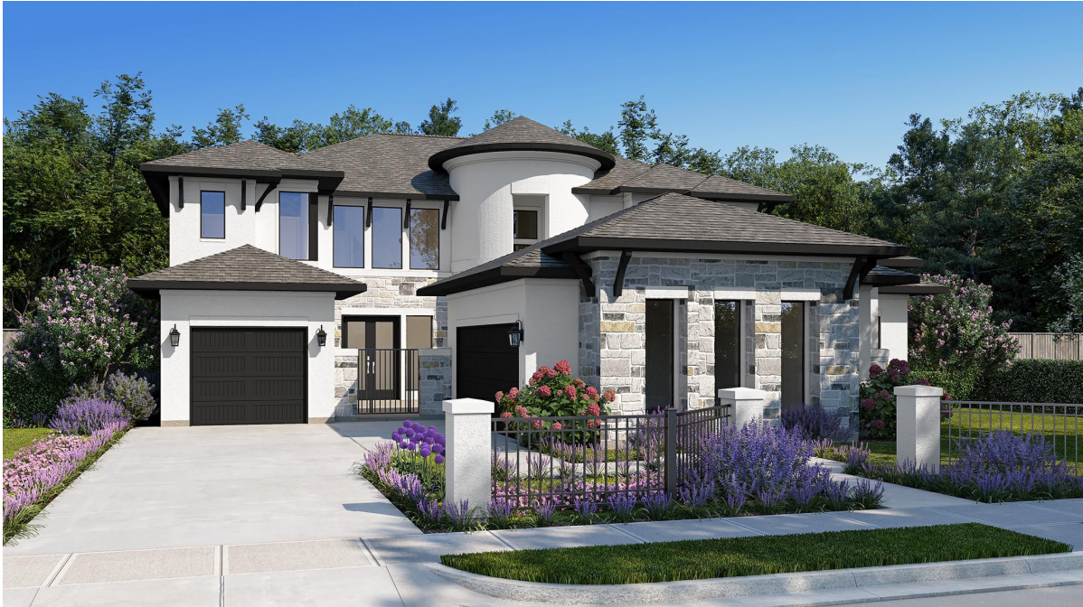
DESIGN 4377S E-70