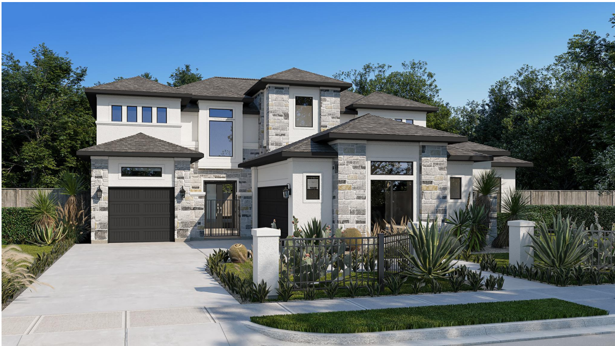
DESIGN 4377S E-2