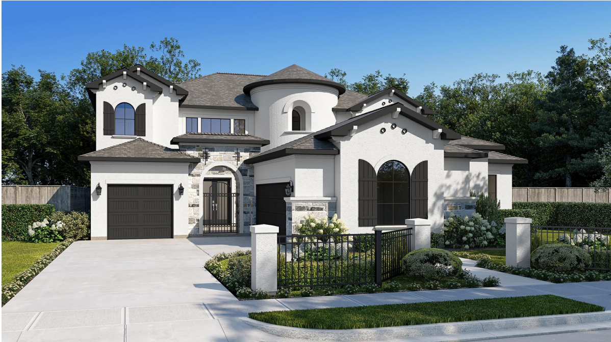
DESIGN 4377S E-1