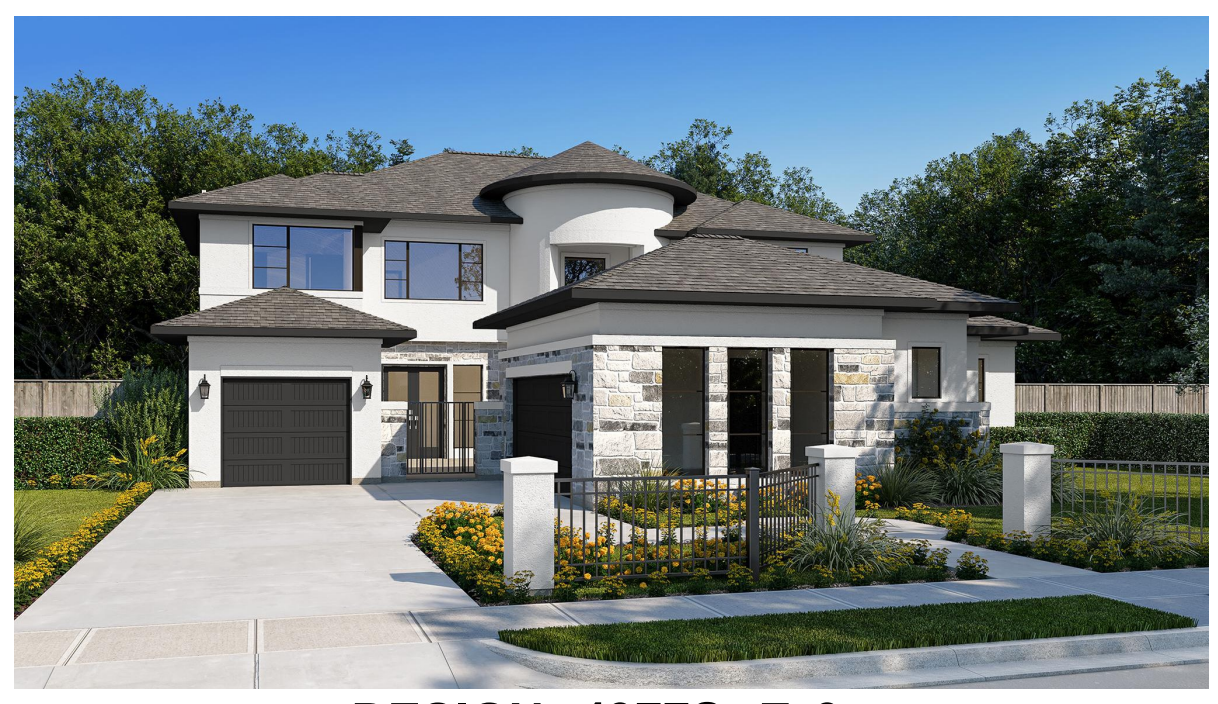
DESIGN 4377S E-3