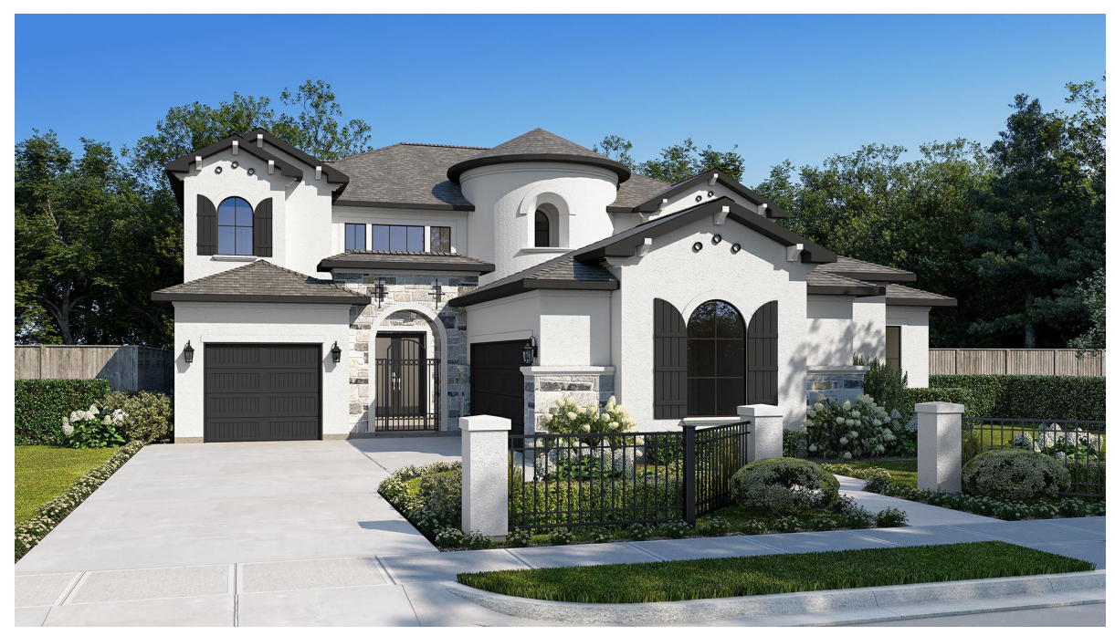
DESIGN 4377S E-1