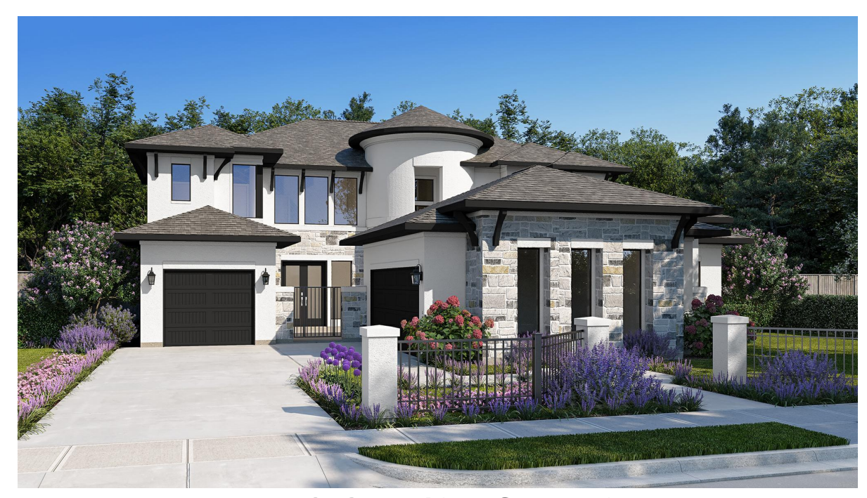
DESIGN 4377S E-70