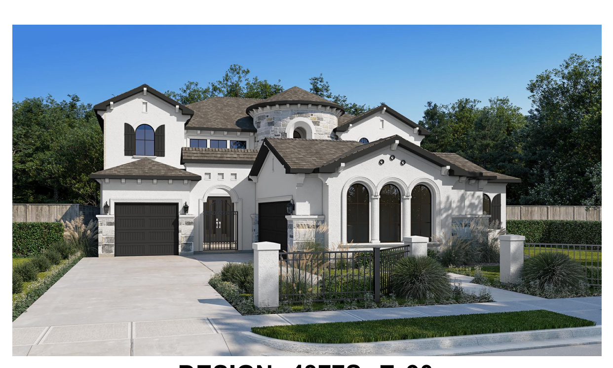
DESIGN 4377S E-90

This design, as originally designed and prior to any changes you make, is estimated to yield approximately the number of square feet shown on page 1. All dimensions are approximate. Square footage may vary based on as-built dimensions, configurations, plan options and/or the method of calculation. Designs are not-to-scale, and are conceptual illustrations that may differ from construction plans or completed improvements. A design may depict features not available on all homesites or in all communities. Perry Homes reserves the right to make changes in plans and specifications, and to substitute material of similar quality. Prices, terms, promotions, plans, dimensions, features, options, amenities, elevations, designs, square footages, specifications, materials, and availability of homes or communities to change without notice or obligation. All obligations will be governed by a written contract. This design does not constitute a commitment to build a particular floor plan or home in any given community. Some floor plans, options, and/or elevations may not be available on certain homesites or in a particular community and may require additional charges. Please check with Perry Homes to verify current offerings in the communities and are considering. This rendering is the property of Perry Homes. LLC. Any reproduction or exhibition is strictly prohibited @ Perry Homes LLC. 2019.