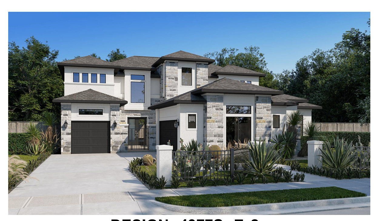
DESIGN 4377S E-2