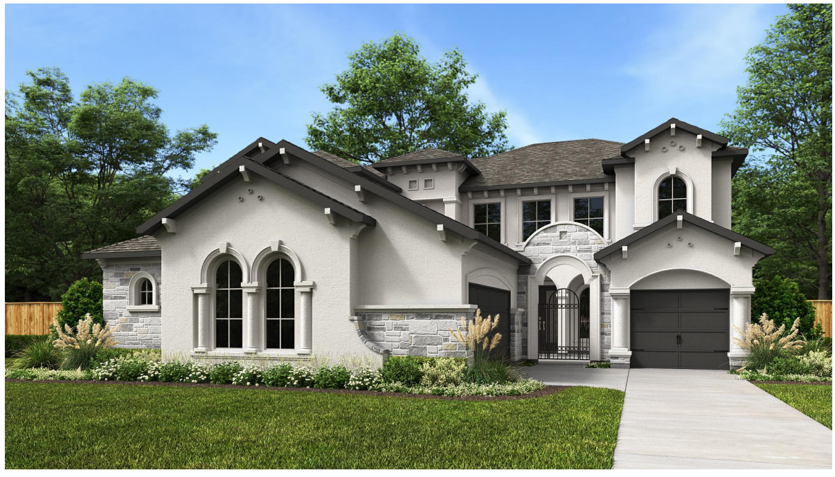
DESIGN 4379S E-100