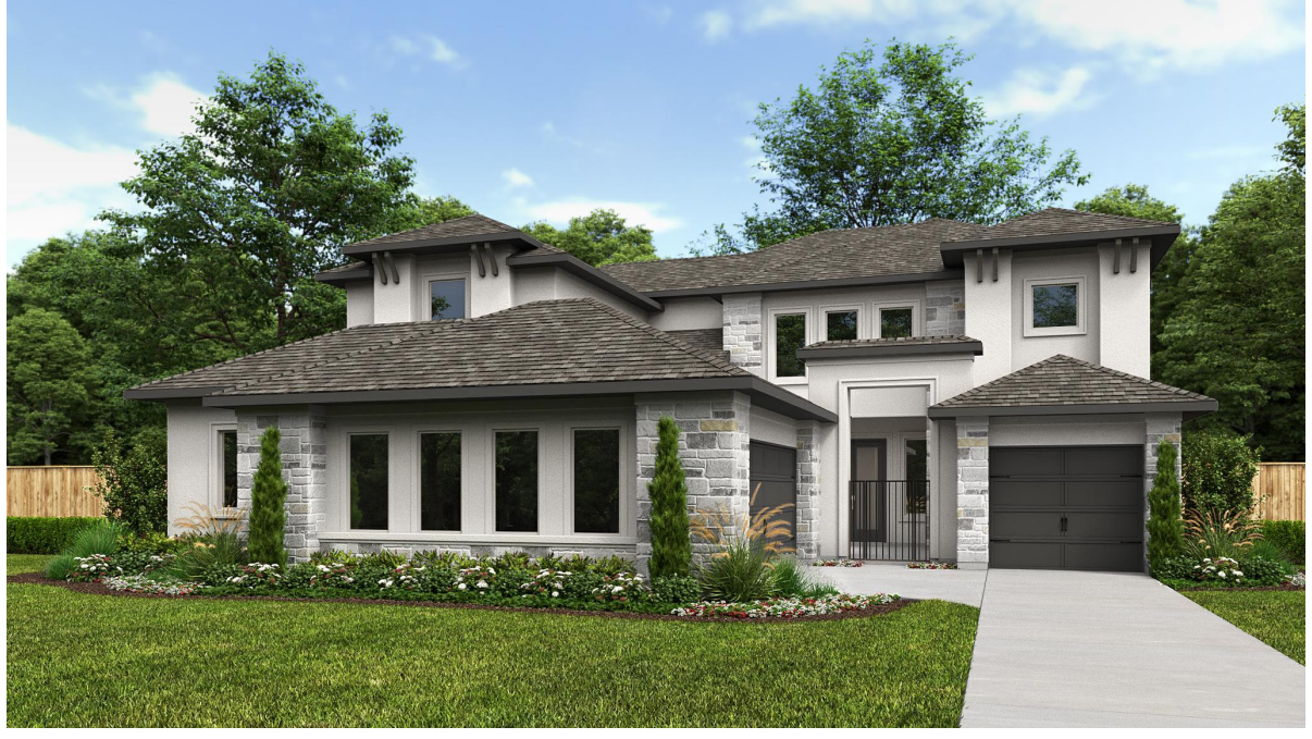
DESIGN 4379S E-1