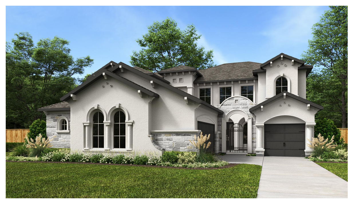
DESIGN 4379S E-100