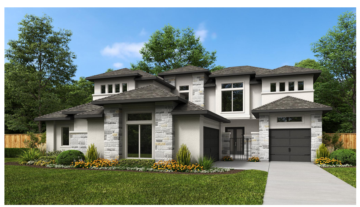
DESIGN 4379S E-2