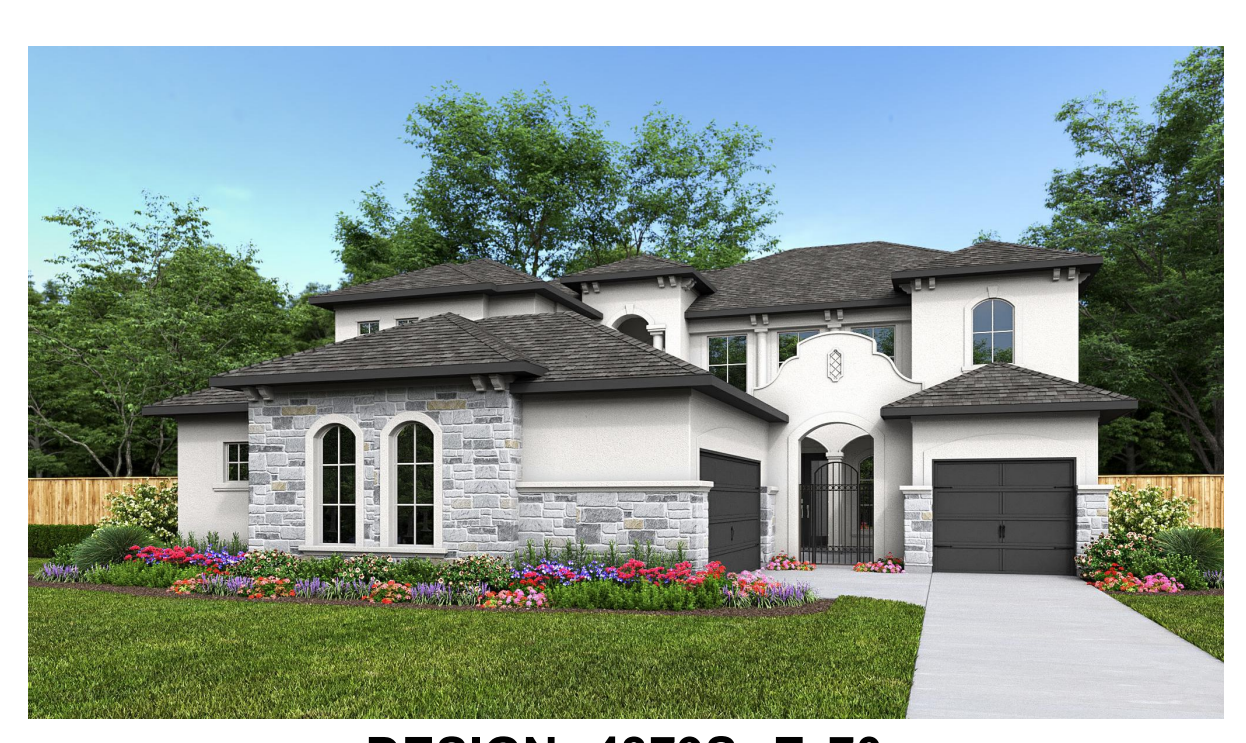
DESIGN 4379S E-70