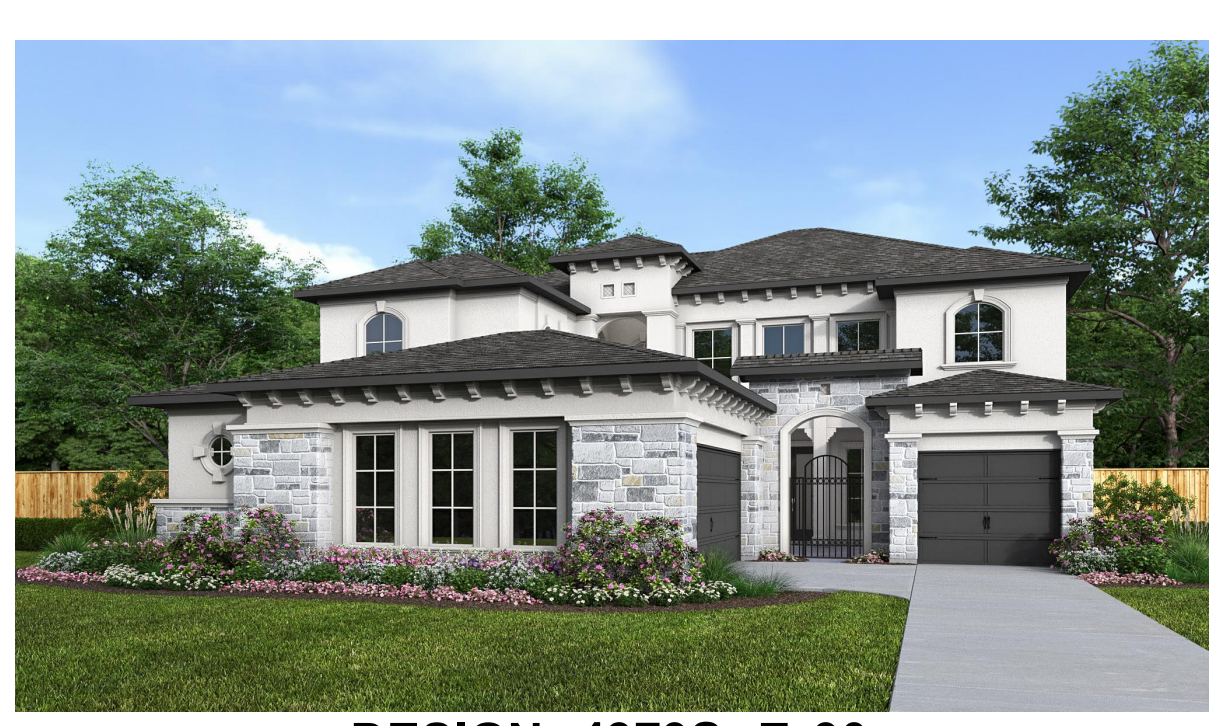
DESIGN 4379S E-90

This design, as originally designed and prior to any changes you make, is estimated to yield approximately the number of square feet shown on page 1. All dimensions are approximate. Square footage may vary based on as-built dimensions, configurations, plan options and/or the method of calculation. Designs are not-to-scale, and are conceptual illustrations that may differ from construction plans or completed improvements. A design may depict features not available on all homesites or in all communities. Perry Homes reserves the right to make changes in plans and specifications, and to substitute material of similar quality. Prices, terms, promotions, plans, dimensions, features, options, amenities, elevations, designs, square footages, specifications, materials, and availability of homes or communities are subject to change without notice or obligation. All obligations will be governed by a written contract. This design does not constitute a commitment to build a particular floor plan or home in any given community Some floor plans, options, and/or elevations may not be available on certain homesites or in a particular community and may require additional charges. Please check with Perry Homes to verify current offerings in the communities are considering. This rendering is the property of Perry Homes II C. Any reproduction or exhibition is strictly prohibited @ Perry Homes II C. 2024