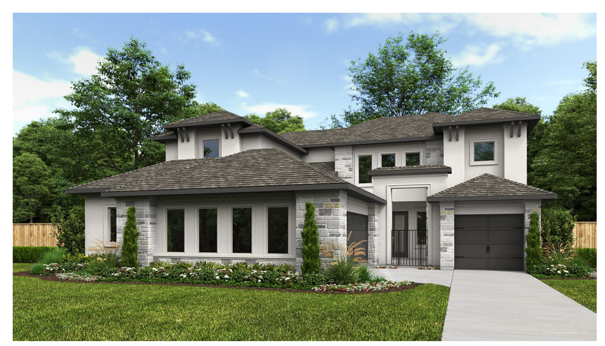
DESIGN 4379S E-1