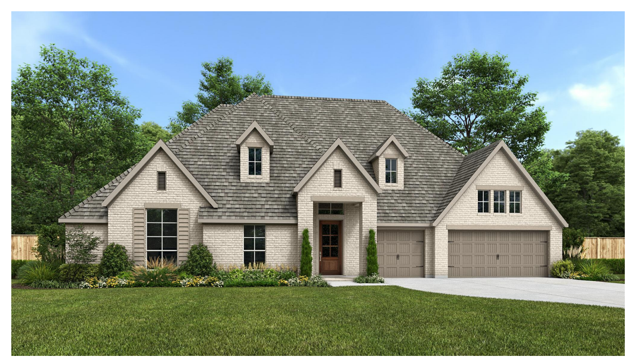
DESIGN 4411W E-1