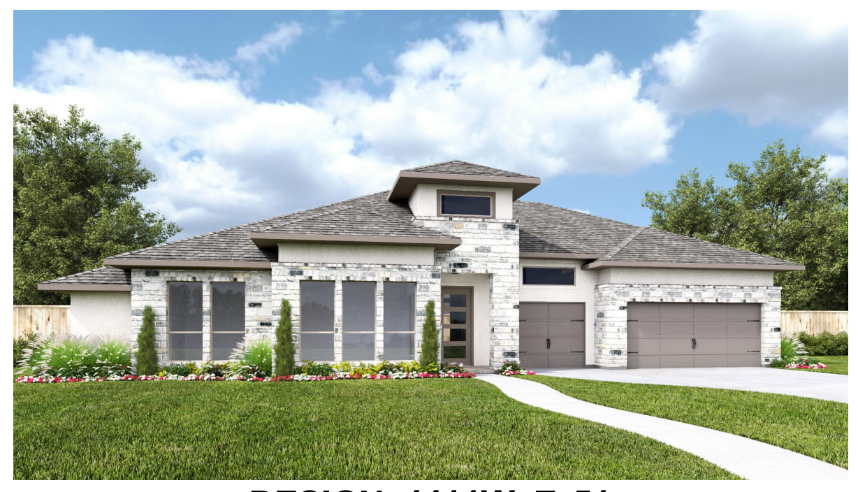
DESIGN 4411W E-51

This design, as originally designed and prior to any changes you make, is estimated to yield approximately the number of square feet shown on page 1. All dimensions are approximate. Square footage may vary based on as-built dimensions, configurations, plan options and/or the method of calculation. Designs are not-to-scale, and are conceptual illustrations that may differ from construction plans or completed improvements. A design may depict features not available on all homesites or in all communities. Perry Homes reserves the right to make changes in plans and specifications, and to substitute material of similar quality. Prices, terms, promotions, plans, dimensions, features, options, amenities, elevations, designs, square footages, specifications, materials, and availability of homes or communities are subject to change without notice or obligation. All obligations will be governed by a written contract. This design does not constitute a commitment to build a particular floor plan or home in any given community Some floor plans, options, and/or elevations may not be available on certain homesites or in a particular community and may require additional charges. Please check with Perry Homes to verify current offerings in the communities you are considering. This rendering is the property of Perry Homes LLC. Any reproduction or exhibition is strictly corphibited. @ Perry Homes LLC. Perry Homes LLC.