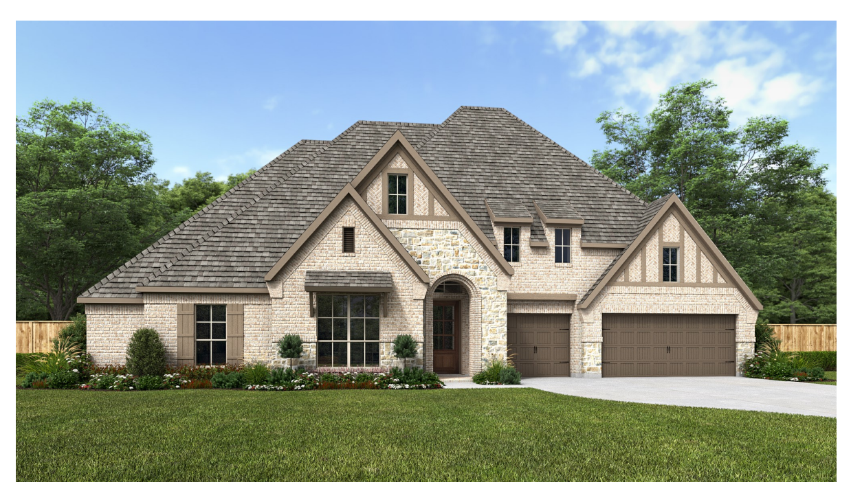
DESIGN 4411W E-50