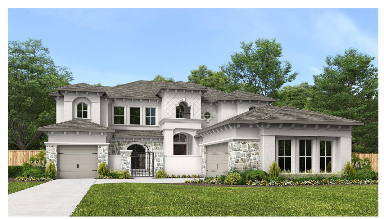
DESIGN 4428S E-30