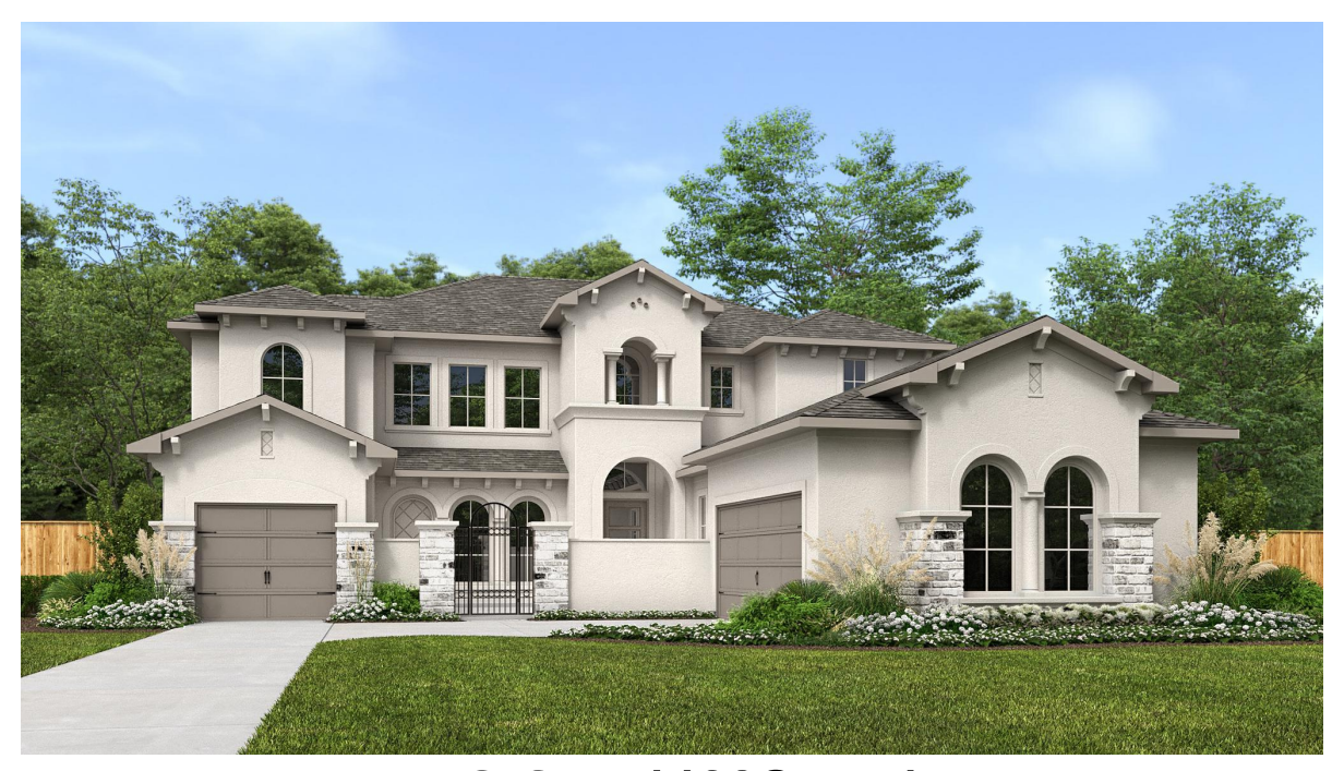
DESIGN 4428S E-1