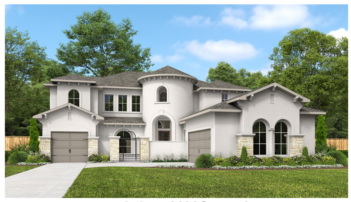
DESIGN 4428S E-50