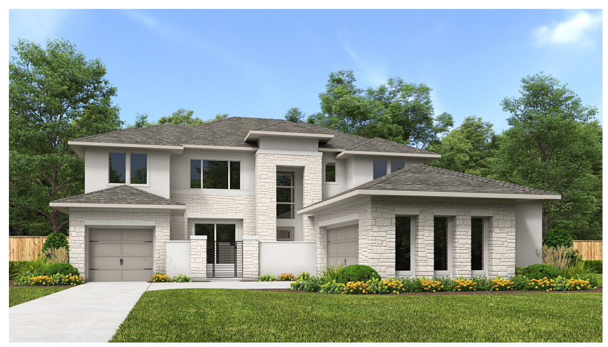
DESIGN 4428S E-31