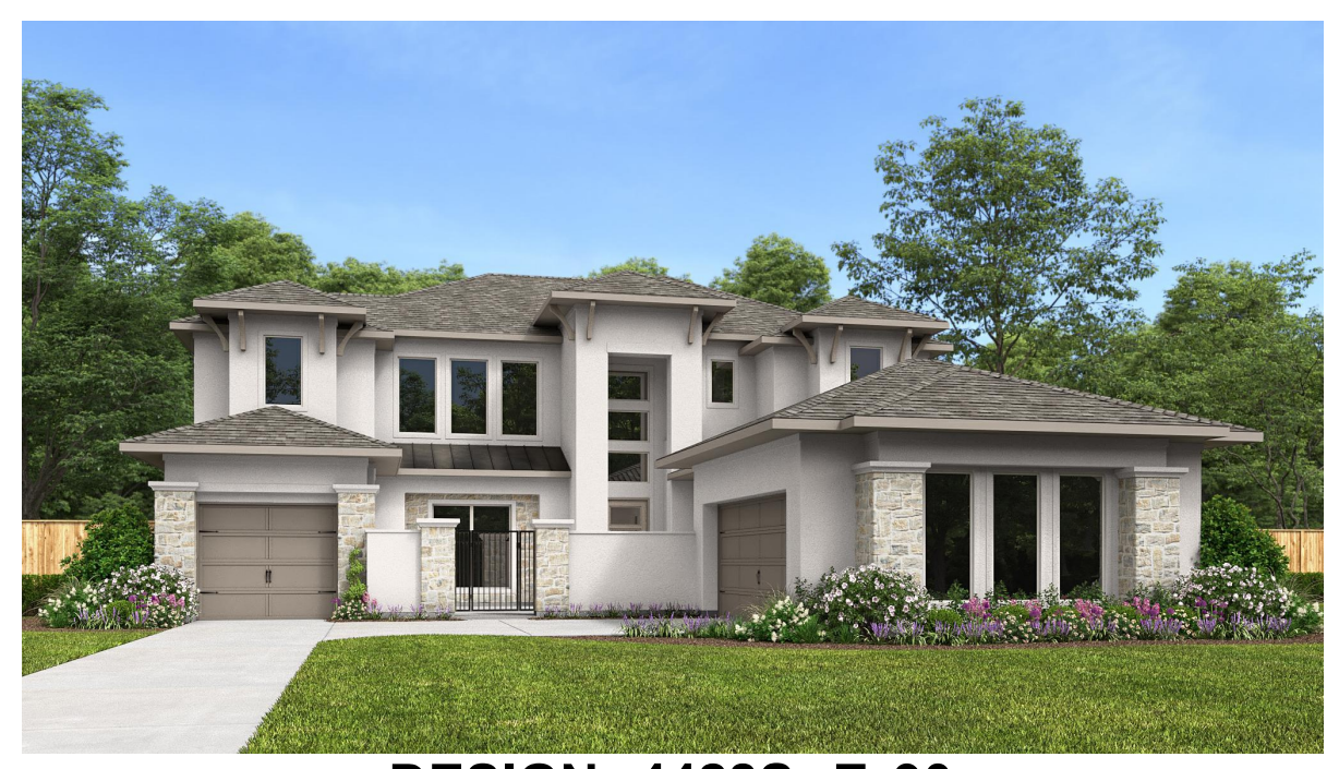
DESIGN 4428S E-90

This design, as originally designed and prior to any changes you make, is estimated to yield approximately the number of square feet shown on page 1. All dimensions are approximate. Square footage may vary based on as-built dimensions, configurations, plan options and/or the method of calculation. Designs are not-to-scale, and are conceptual illustrations that may differ from construction plans or completed improvements. A design may depict features not available on all homesites or in all communities. Perry Homes reserves the right to make changes in plans and specifications, and to substitute material of similar quality. Prices, terms, promotions, plans, dimensions, features, options, amenities, elevations, designs, square footages, specifications, materials, and availability of homes or communities evaluate to change without notice or obligation. All obligations will be governed by a written contract. This design does not constitute a commitment to build a particular floor plan or home in any given community. Some floor plans, options, and/or elevations may not be available on certain homesites or in a particular community and may require additional charges. Please check with Perry Homes to verify current offerings in the communities you are considering. This rendering is the property of Perry Homes. LLC. Any reproduction or exhibition is strictly prohibited. © Perry Homes. LLC 2023