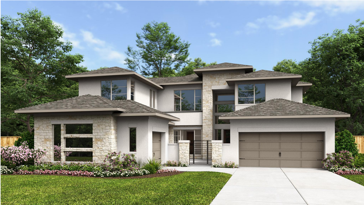
DESIGN 4599S E-1