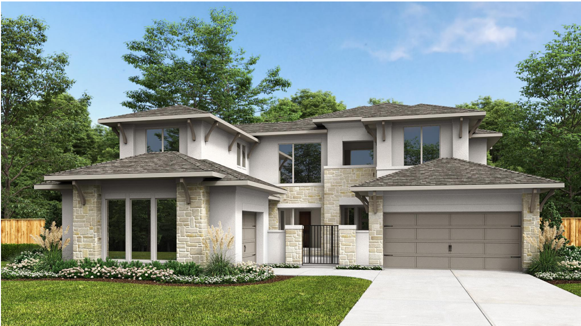
DESIGN 4599S E-50

This design, as originally designed and prior to any changes you make, is estimated to yield approximately the number of square feet shown on page 1. All dimensions are approximate. Square footage may vary based on as-built dimensions, configurations, plan options and/or the method of calculation. Designs are not-to-scale, and are conceptual illustrations that may differ from construction plans or completed improvements. A design may depict features not available on all homesites or in all communities. Perry Homes reserves the right to make changes in plans and specifications, and to substitute material of similar quality. Prices, terms, promotions, plans, dimensions, features, options, amenities, elevations, designs, square footages, specifications, materials, and availability of homes or communities are subject to change without notice or obligation. All obligations will be governed by a written contract. This design does not constitute a commitment to build a particular floor plan or home in any given community. Some floor plans, options, and/or elevations may not be available on certain homesites or in a particular community and may require additional charges. Please check with Perry Homes to verify current offerings in the communities you are considering. This rendering is the property of Perry Homes, LLC. Any reproduction or exhibition is strictly prohibited. © Perry Homes, LLC 2023