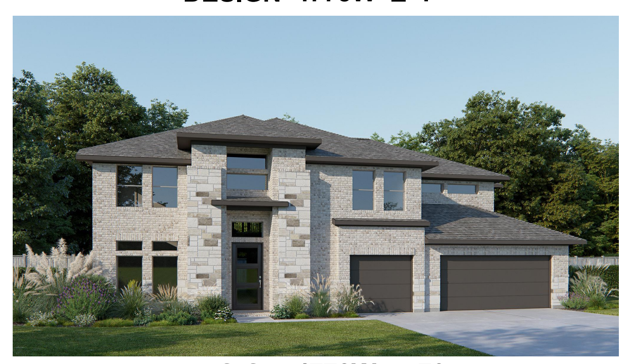
DESIGN 4773W E-70