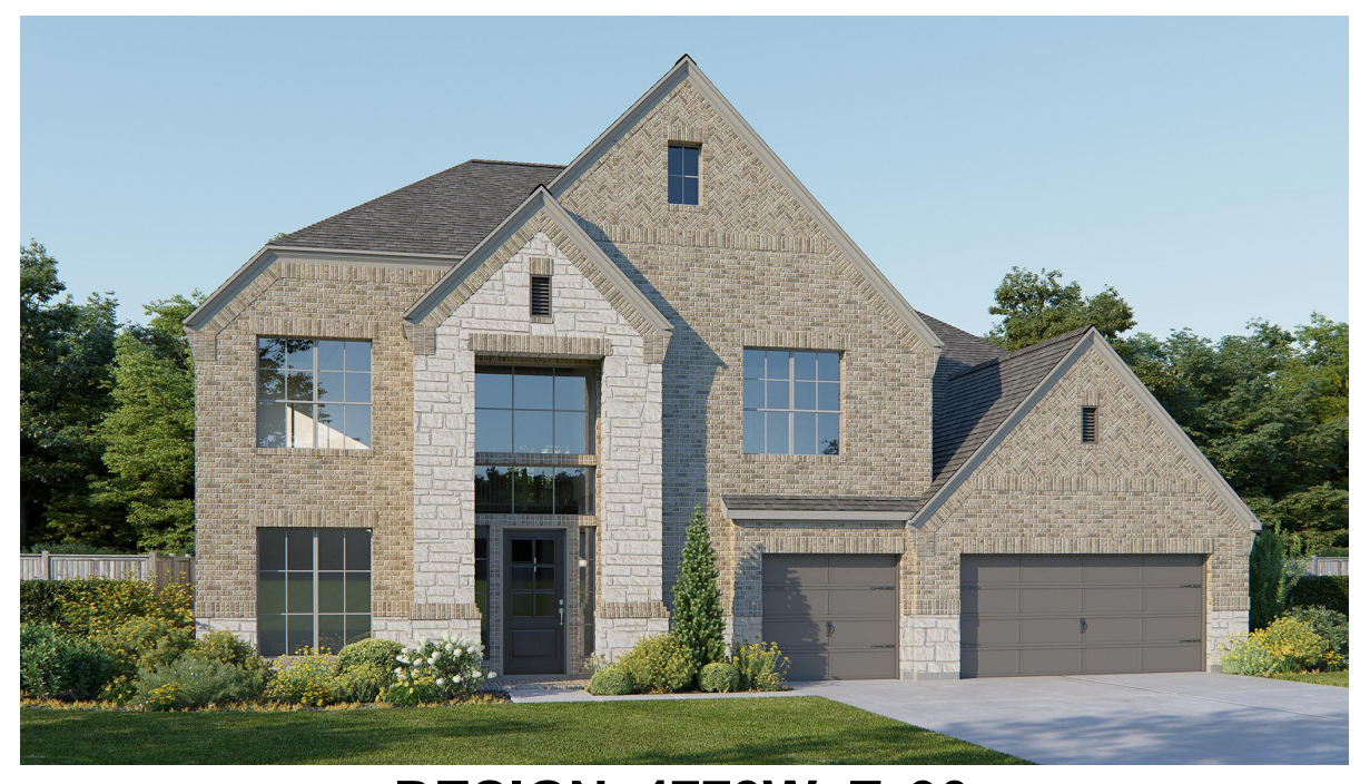
DESIGN 4773W E-90

This design, as originally designed and prior to any changes you make, is estimated to yield approximately the number of square feet shown on page 1. All dimensions are approximate. Square footage may vary based on as-built dimensions, configurations, plan options and/or the method of calculation. Designs are not-to-scale, and are conceptual illustrations that may differ from construction plans or completed improvements. A design may depict features not available on all homesites or in all communities. Perry Homes reserves the right to make changes in plans and specifications, and to substitute material of similar quality. Prices, terms, promotions, plans, dimensions, features, options, amenities, elevations, designs, square footages, specifications, materials, and availability of homes or communities to change without notice or obligation. All obligations will be governed by a written contract. This design does not constitute a commitment to build a particular floor plan or home in any given community. Some floor plans, options, and/or elevations may not be available on certain homesites or in a particular community and may require additional charges. Please check with Perry Homes to verify current offerings in the communities volume considering. This rendering is the property of Perry Homes. LLC. Any reproduction or exhibition is strictly prohibited (@ Perry Homes LLC. 2012).