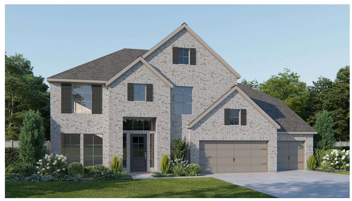
DESIGN 4773W E-1