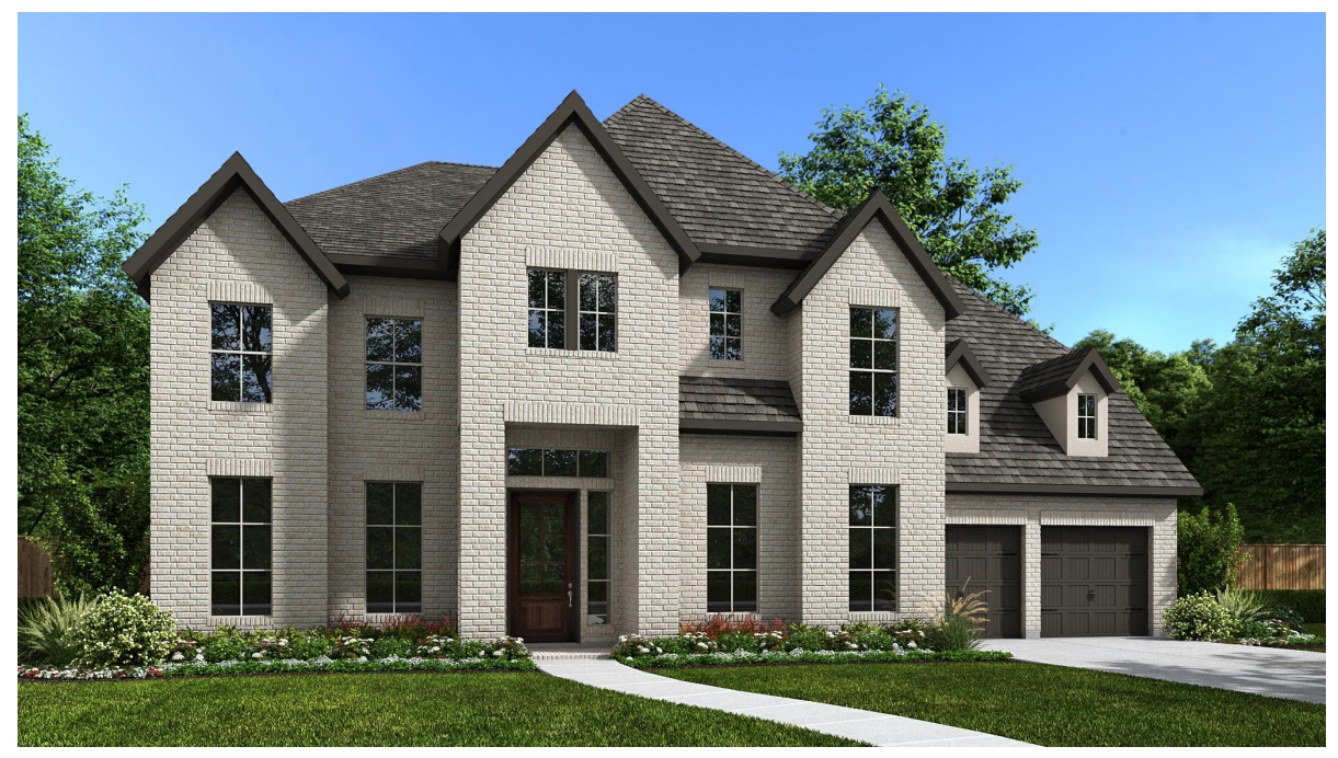
DESIGN 4891W E-1