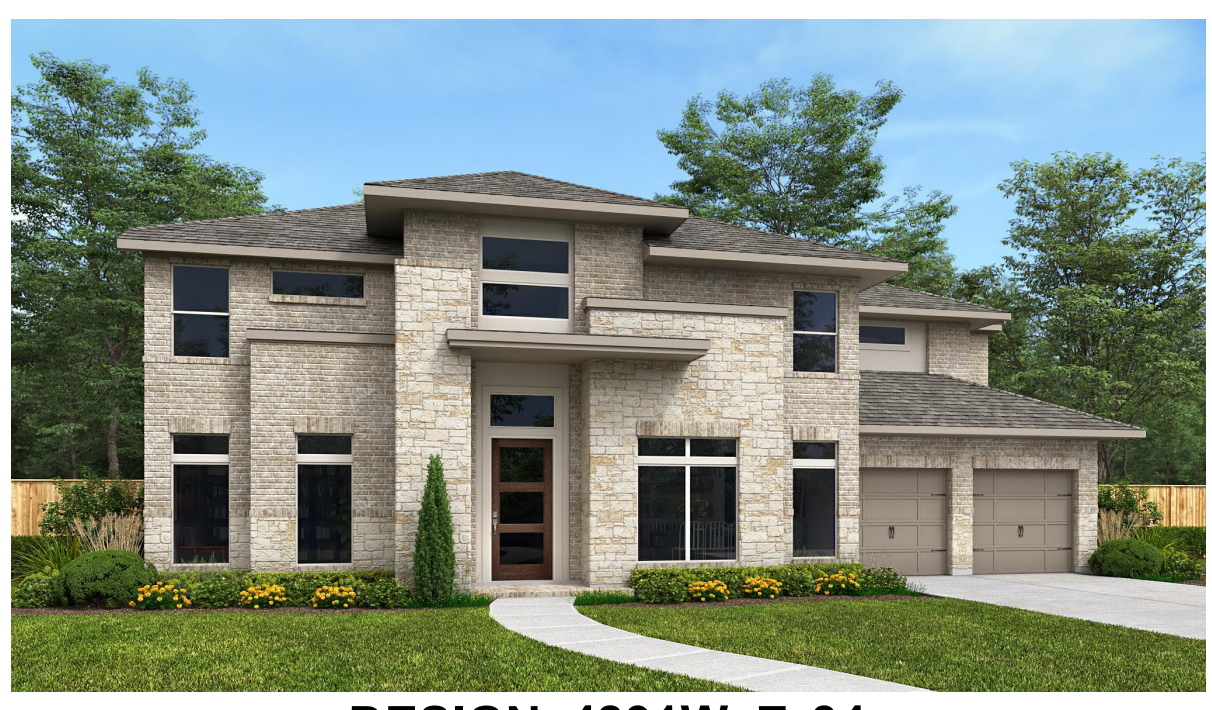
DESIGN 4891W E-34