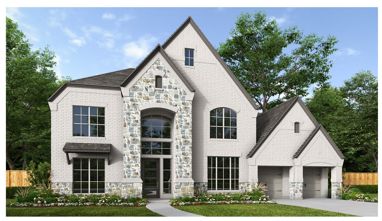
DESIGN 4891W E-101