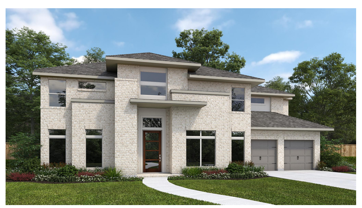
DESIGN 4891W E-3