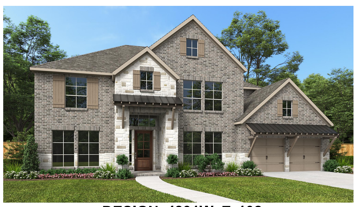
DESIGN 4891W E-102

This design, as originally designed and prior to any changes you make, is estimated to yield approximately the number of square feet shown on page 1. All dimensions are approximate. Square footage may vary based on as-built dimensions, configurations, plan options and/or the method of calculation. Designs are not-to-scale, and are conceptual illustrations that may differ from construction plans or completed improvements. A design may depict features not available on all homesites or in all communities. Perry Homes reserves the right to make changes in plans and specifications, and to substitute material of similar quality. Prices, terms, promotions, plans, dimensions, features, options, amenities, elevations, designs, square footages, specifications, materials, and availability of homes or communities are subject to change without notice or obligation. All obligations will be governed by a written contract. This design does not constitute a commitment to build a particular floor plan or home in any given community of the property of perry Homes. LLC and the community and may require additional charges. Please check with Perry Homes to verify current offerings in the communities you are considering. This rendering is the property of Perry Homes. LLC. Any reproduction or exhibition is strictly prohibited. © Perry Homes. LLC 2024