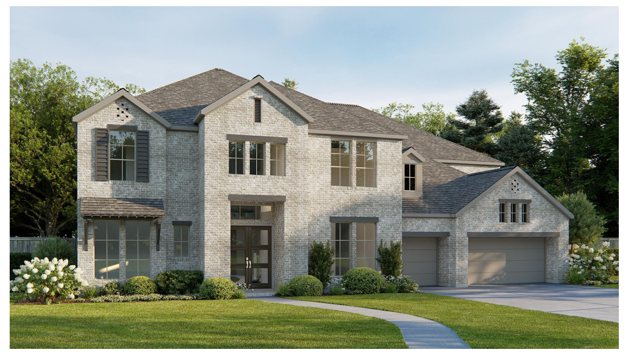
DESIGN 4978W E-1